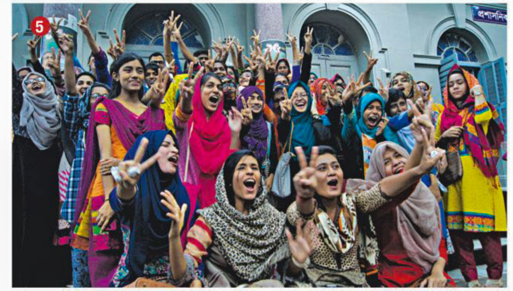
Students' jubilation all around with students shouting and jumping in sheer joy after the results of this year's HSC examinations were published yesterday. 1) Chittagong College. 2) A student of Rangpur Cantonment Public School and College hugs his smiling mother while celebrating his result. 3) Rajuk Uttara Model College in the capital. 4) Pabna Cadet College. 5) Sylhet Government Women's College. 6) Notre Dame College, Dhaka. 7) Mymensingh Girls' Cadet College. 8) Rajshahi College.