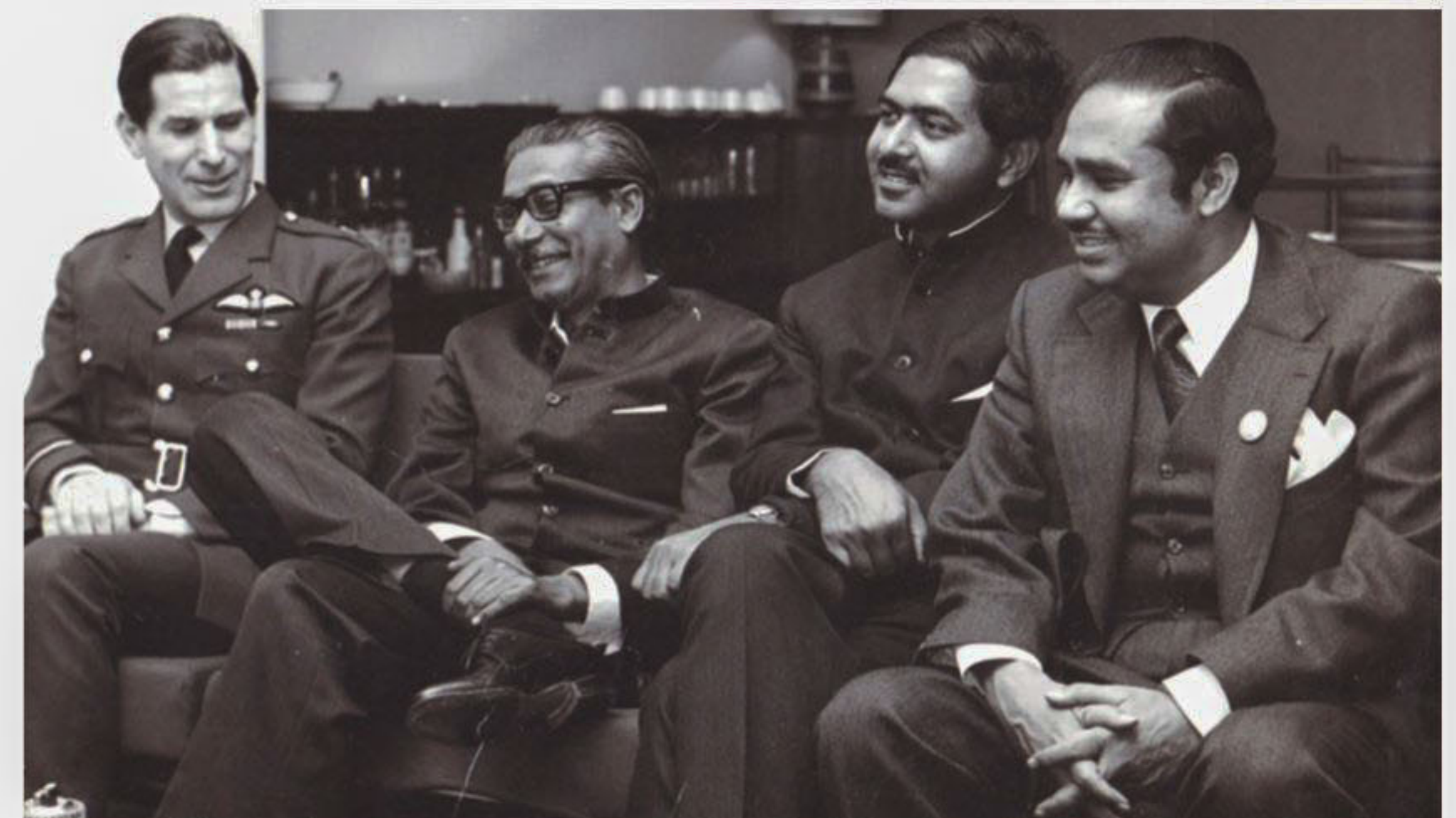
An image by S.S. Banerjee.

A three-day (August 18-20) photography exhibition titled "London 1971" opens today at 4:30pm at Gallery-5 of National Art Gallery of Bangladesh Shilpakala Academy (BSA). Asaduzzaman Noor, Cultural Affairs Minister, will inaugurate the exhibition. Project London 1971 supported by the Ministry of Cultural Affairs, BSA and other private institutions has organised the exhibition.