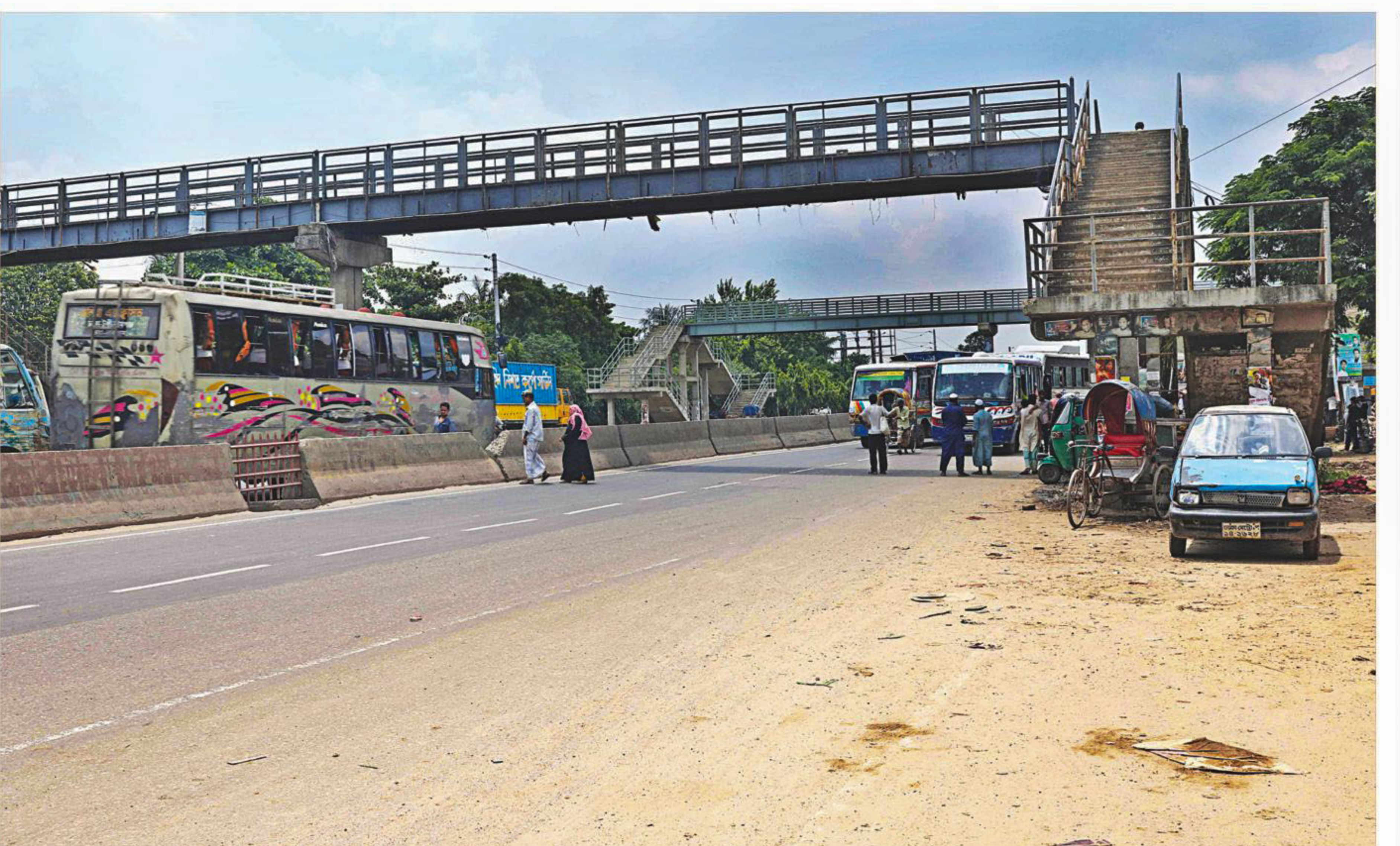
Two foot bridges, built just yards of each other for reasons yet to be known and as per dimensions of the former two lane Dhaka-Chittagong highway, continue to exist even though the road has been upgraded to four lanes, posing a threat for unsuspecting vehicles which might miss the shrinking of lanes at this spot near the Dania College in Jatrabari. The photo was taken on Monday.

The OC said a case was filed with the police station, accusing Liton, who confessed to the crime during primary interrogation.