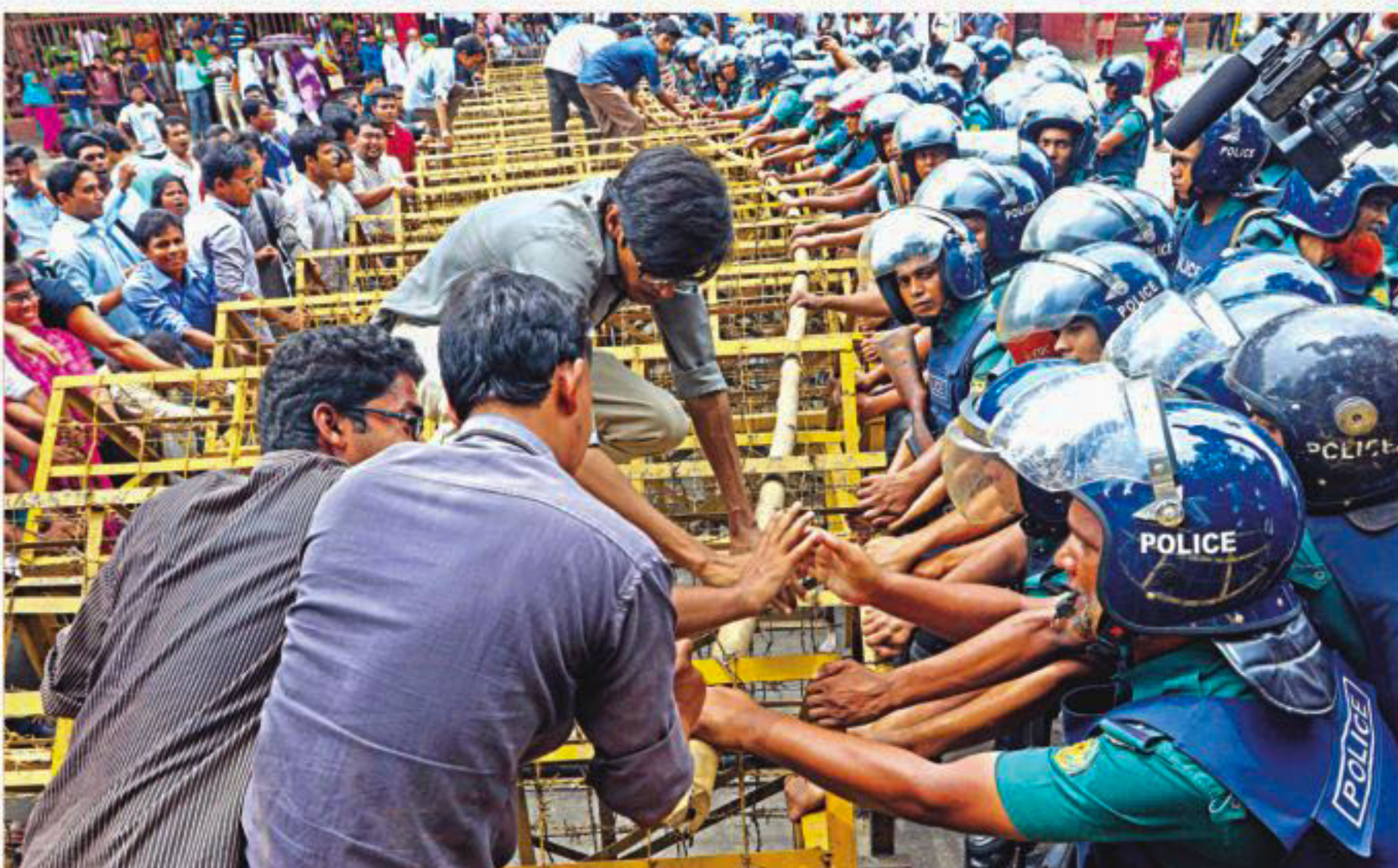
Activists of left student organisations climb on the barbed wire barricades as they try to break through them, during an anti-Rampal power plant demonstration.

Intercepted by police at Shahbagh, six injured