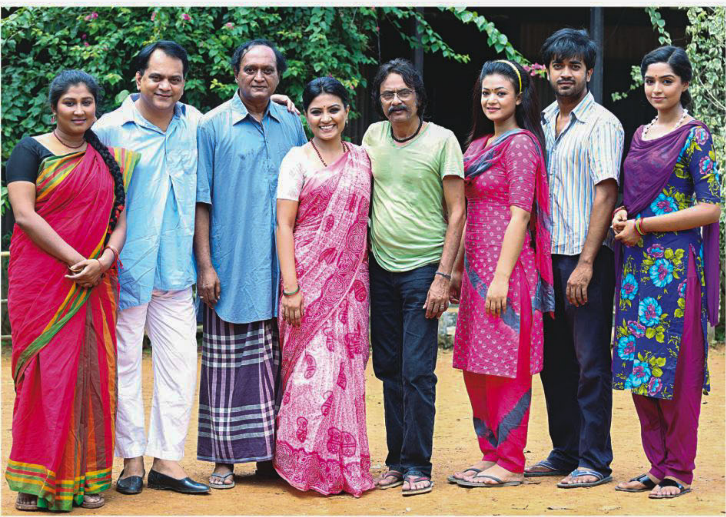
The director (4-R) with the cast of the play.