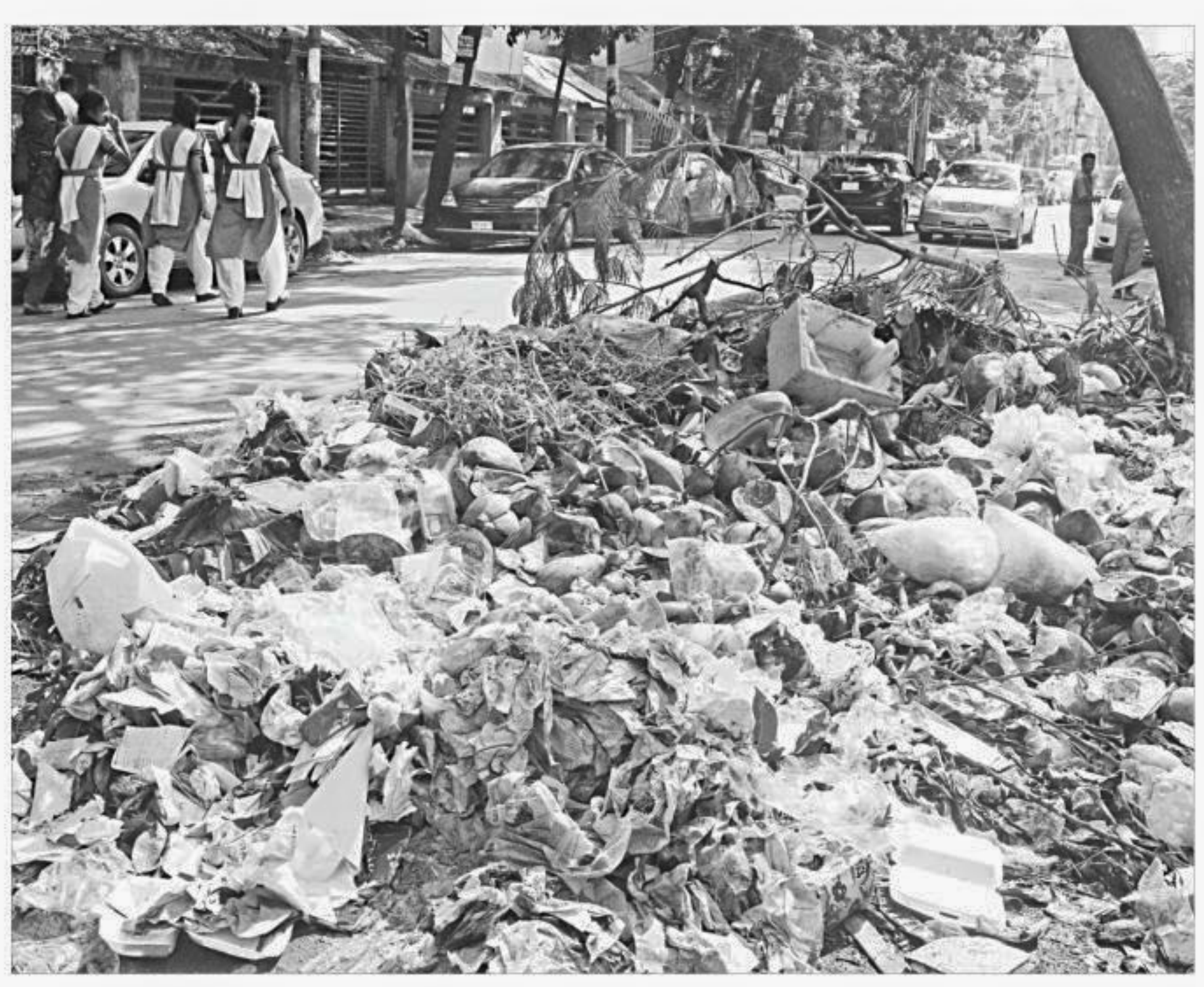
Garbage piled up on Dhanmondi Road 5 in the capital for the last couple of days though the city corporation is supposed to remove such wastes every day. The photo was taken on Sunday.