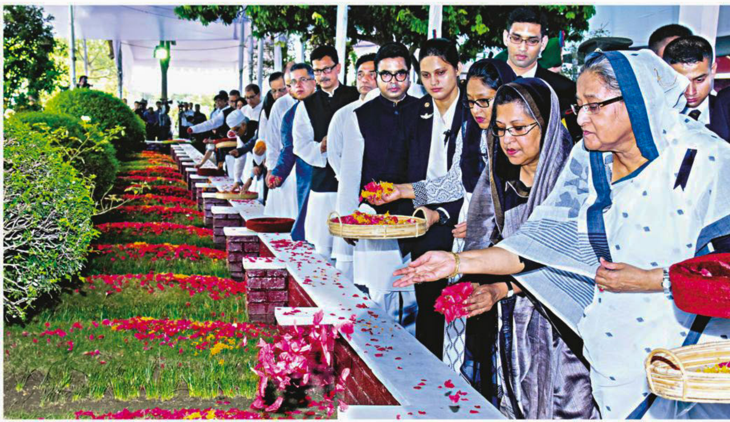
Prime Minister Sheikh Hasina, her sister Sheikh Rehana and daughter Saima Wazed Putul sprinkle flower petals on the graves of their family members, who were brutally killed on August 15, 1975, at the capital's Banani Graveyard yesterday on the occasion of the National Mourning Day.