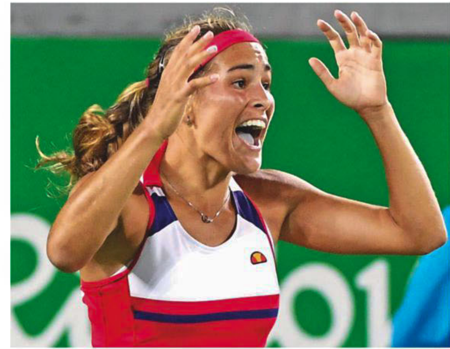
Puerto Rico's Monica Puig won gold by beating Germany's Angelique Kerber in the Olympic women's singles tennis.

Murray, however, had a much easier time dispatching Nishikori 6-1, 6-4 in just one and a half hours. After having battled through three-sets in the previous two rounds, the three-time Grand Slam champion showed his best form against the Japanese and was already looking for a repeat of his London 2012 triumph, a win that will make him the only tennis