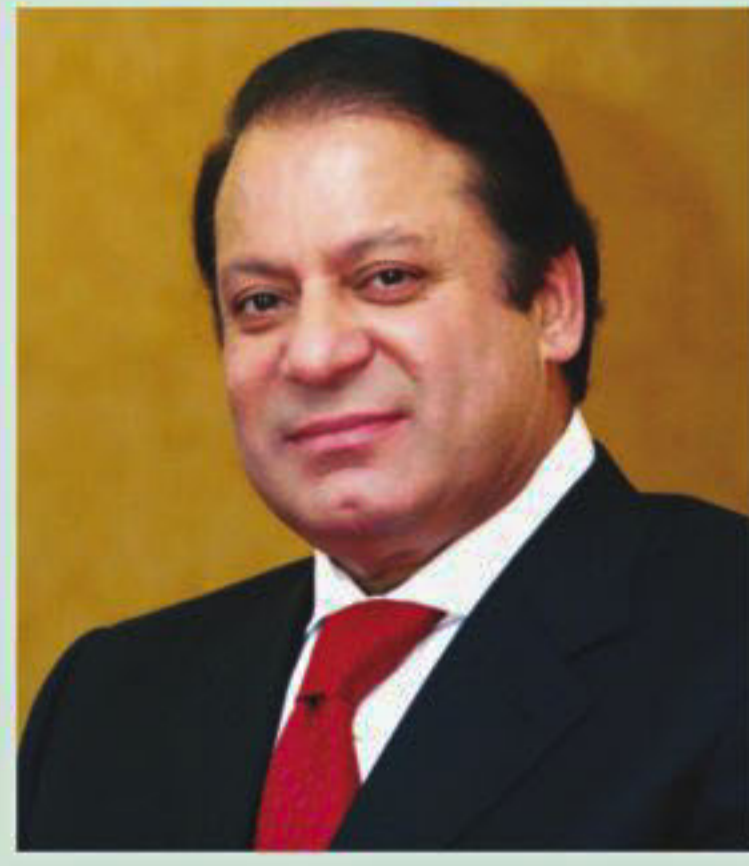
Muhammad Nawaz Sharif Prime Minister of the Islamic Republic of Pakistan

M Y Dear Countrymen! This year, the day of 14th August, besides the traditional pleasure, also carries deep feelings of grief. The pain of Quetta's martyrs is still fresh. Today, we are also remembering those martyrs, who sacrificed their lives to protect this independence. This day is dawning with the determination of the Pakistani nation that Pakistan, with the grace of Allah Almighty, will remain forever. The spirit of 1965 is still alive with full vigor, when Pakistani armed forces and the people together confronted the enemy.