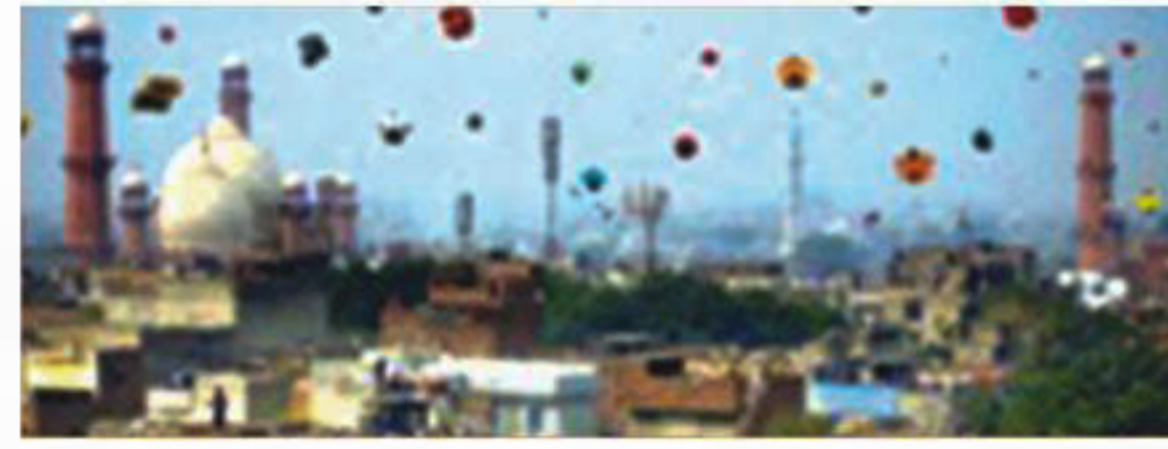
Kite flying (Basant) in Lahore (Punjab)

Lahore is a centre for performing arts and organizes international musical events, plays and theatre performances. The newly established National Gallery of Arts in Islamabad is emerging as another centre of cultural activity in the capital.