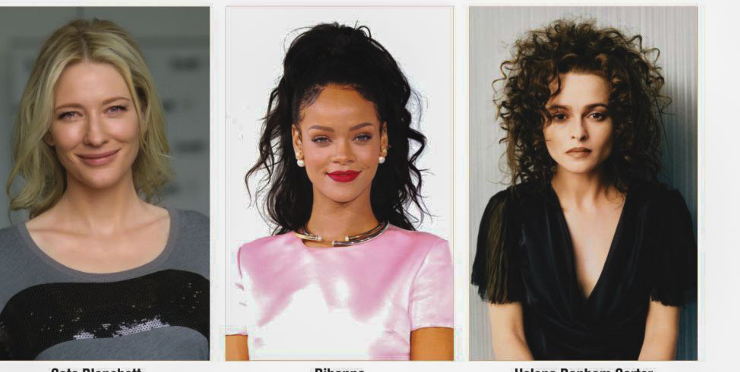
Cate Blanchett, Rihanna, Helena Bonham Carter

An all-female offshoot of 'Ocean's Eleven' is in the works. According to The Hollywood Reporter, seven of the eight main roles have already been cast for the upcoming 'Ocean's Ocho' caper film. Gary Ross, who cowrote the script with Olivia Milch, will helm the film. As with the reboot franchise's previous movies, 'Ocean's Ocho' will be a star-studded affair. Rihanna is among the stars to have signed on to the Warner Bros. movie, along with Sandra Bullock, Cate Blanchett, Anne Hathaway, Helena Bonham Carter, Mindy Kaling and rapper/actress Awkwafina, THR confirmed. There is still one spot remaining to round out the principal cast. As Deadline reports, Steven Soderbergh, who helmed 2001's 'Ocean's Eleven' remake and sequels 'Ocean's Twelve' and 'Ocean's Thirteen,' will produce 'Ocean's Ocho.' The film is slated to begin production this October in New York. 'Ocean's Ocho's' cast announcement follows on the heels of this summer's all-female reboot of 'Ghostbusters', which caused a stir amid fans of the original male version. SOURCE: ROLLING STONE