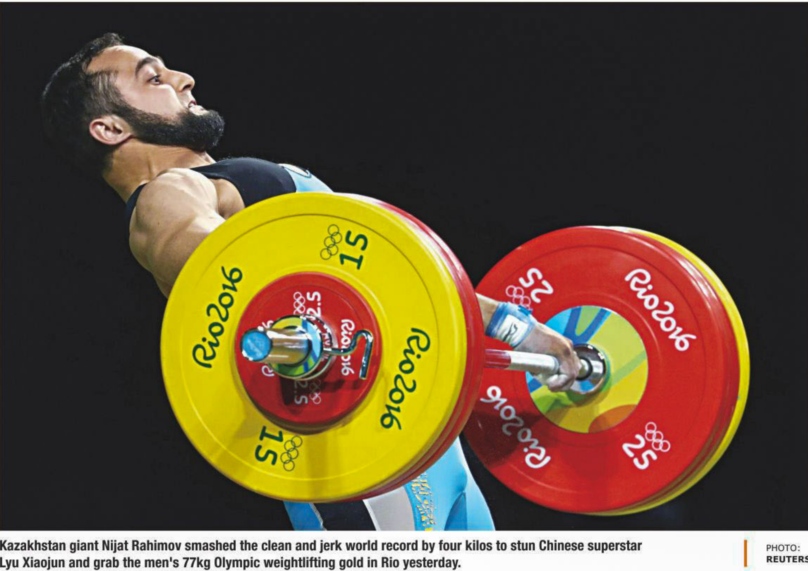
Kazakhstan giant Nijat Rahimov smashed the clean and jerk world record by four kilos to stun Chinese superstar Lyu Xiaojun and grab the men's 77kg Olympic weightlifting gold in Rio yesterday.