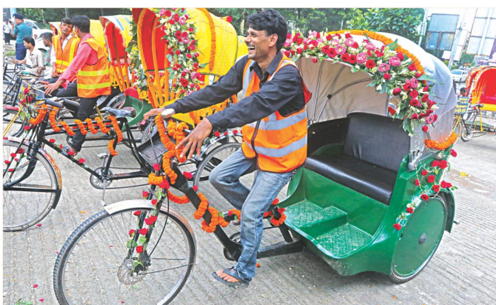
Special rickshaws in front of Police Plaza in Gulshan-1. Bottom left, AC buses that will ply in Gulshan, Banani areas. Right, LGD Minister Khander Mosharrar Hossain and DNCC Mayor Anisul Haq inaugurating the new bus service yesterday.