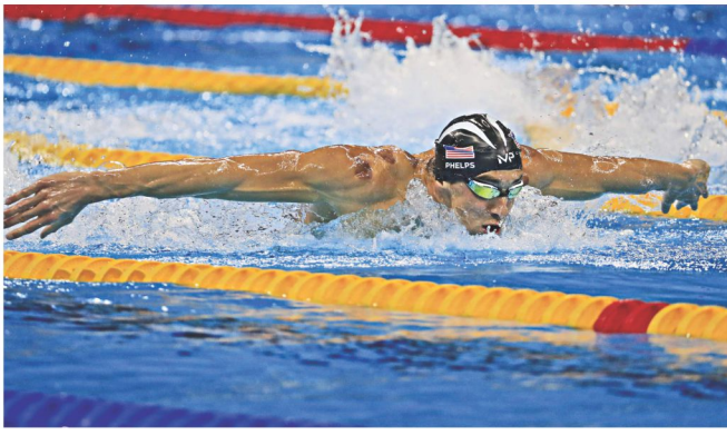
USA's Michael Phelps competes on his way to winning the gold medal in the Men's 200m Butterfly Final at the Olympic Aquatics Stadium in Rio de Janeiro, Brazil, on Tuesday.