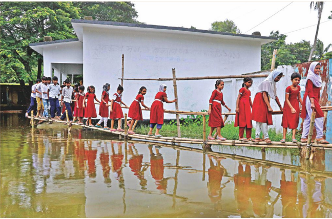
Students walk on this bamboo bridge to return home from Kamargang Ideal High School in Munshiganj's Srinagar. The ground floor of the school building has remained under 2 to 3-foot water for the last one month due to rain and subsequent flooding in the area. Water flooded the office room as well. The photos were taken on Tuesday.