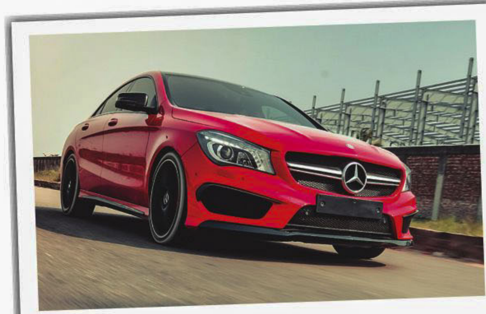
Probably the closest we've come to our expectations being met on a test drive. We expected the Mercedes CLA45 AMG to be a proper AMG - loud, fast, curvaceous and dripping with presence. We got the car all to ourselves thanks to Zaeem and Imran Aziz, and pushing it to almost 240 km/h (safely!) was a soulful experience.

For three years, Shift has landed on the breakfast table of countless families around the country, only to be grabbed by the teens and the tweens, a momentous occasion since it's probably the only way to get them to pick up a pink page that would otherwise be filled with news of stocks and mergers. The main reason for that has to be the cars we've highlighted today - the loud ones, the ones that break down often and the ones that make their owners suffer the most. For each one, there's an interesting back story, and through each we came to know a bunch of people who think like us, talk like us but are thinner because once you own a performance car, you have to give up eating entirely. We're grateful to these machines and the people behind them, because without them we wouldn't be here, nor have a voice.