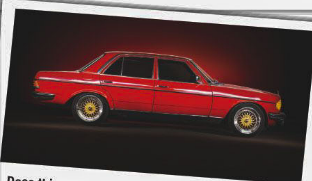
Does this restomodded Mercedes Benz W123 look like it can get into a car lift? It was an imposing task, getting this piece of precious, classic metal, belonging to Zaeem Aziz, into a cramped space to take it to a deserted 2nd floor of the Daily Star office, all in search of that perfect shot. Rahin delivered.