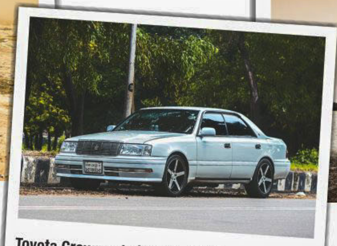
Toyota Crown + twin turbo 2JZGTE + stock brakes = fighting for our lives on the road.