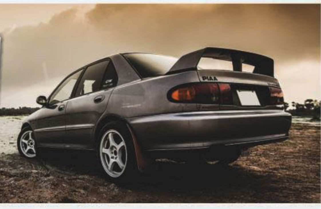
We went rallying in a Mitsubishi Lancer GSR and Noor Alam Ovi made our hearts stop, powersliding towards a tree at 120 km/h. We also ate a ton of dust and learned what it means to fly in a car.