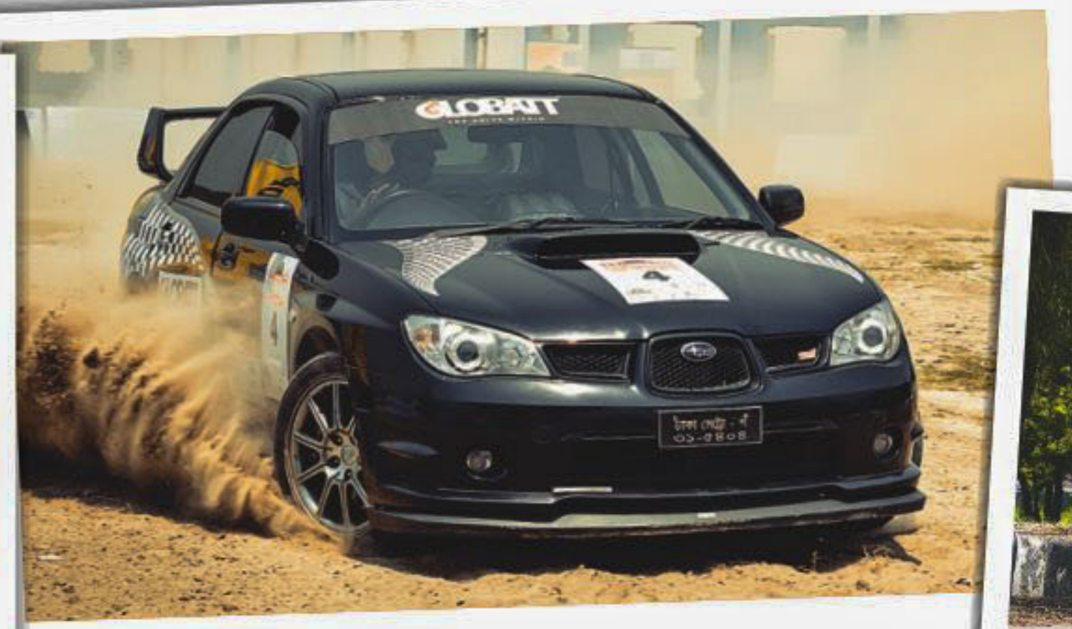
Covering the now-annual Rallycross Championship was a bigger deal because of Joy Alam's insane, 800+ HP Subaru STI. The ride along was crazy, the car was more than the sum of its parts, the owner's driving skills were impressive.