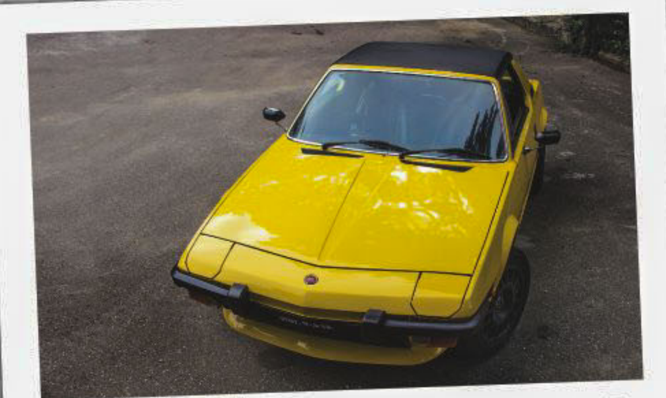
One of the first unique cars we shot - a classic, 1977 Fiat X1/9 with a mid-mounted Toyota 4EFT 1.3 turbo engine. The tiny, yellow, duck-faced car showed us that custom cars in Bangladesh were about more than a spoiler on a Toyota Premio.