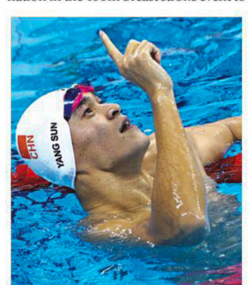
Sun wins 200m freestyle gold

Ryan Murphy and Lilly King extended the United States swimmers' run of domination in the 100m breast stroke event to