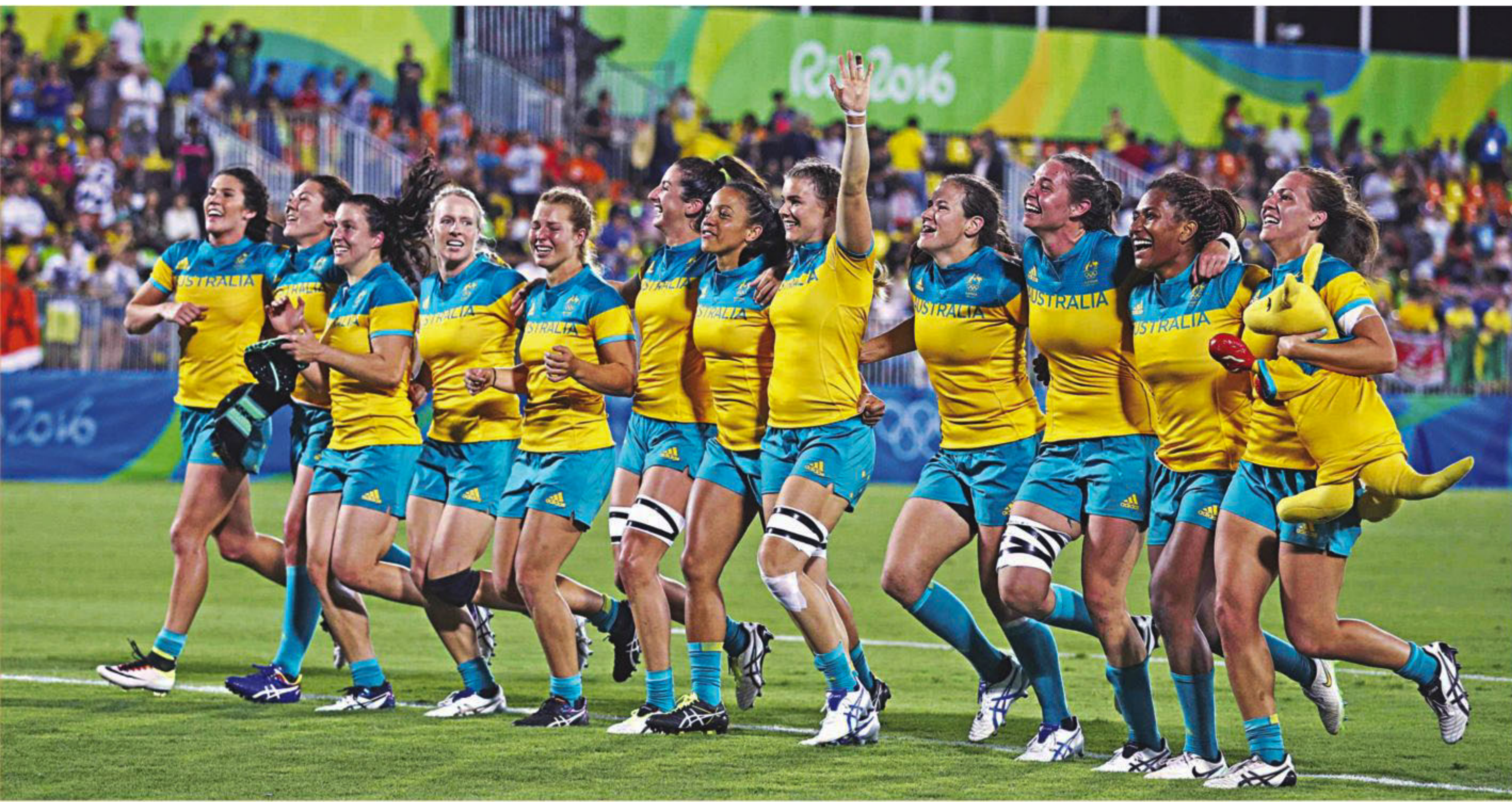
Australia players celebrate their victory in the inaugural women's rugby sevens gold medal match against New Zealand during the Rio 2016 Olympic Games at the Deodoro Stadium in Rio de Janeiro on Monday.

Bangladesh Premier League Uttar Baridhara v Rahmatganj Venue: Rafiq Uddin Bhuiyan Stadium, Mymensingh Time: 4:00pm