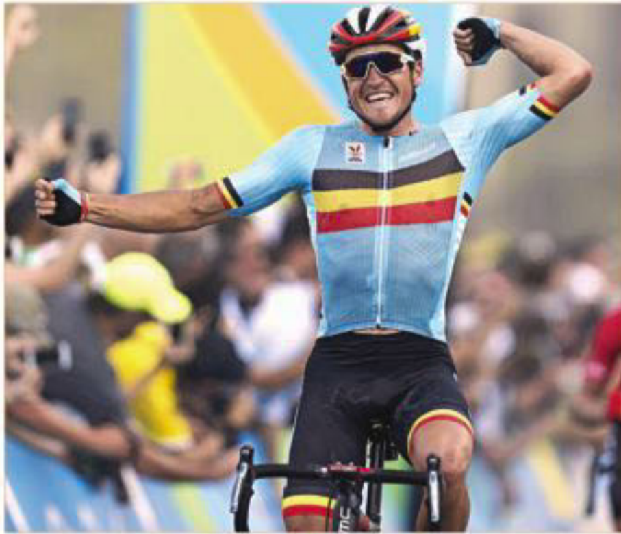
Greg Van Avermaet took gold after having navigated a tough course which saw only 63 of 144 starters finish in the Olympics cycling road race.

He won a Tour de France stage last month