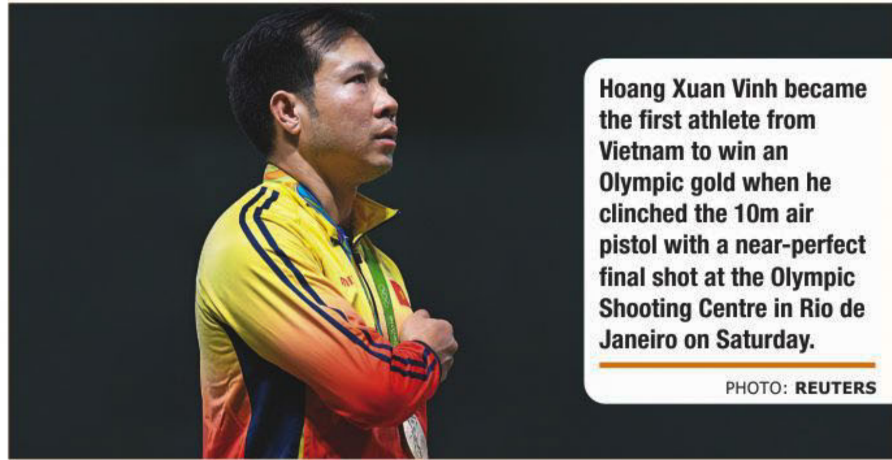
Hoang Xuan Vinh became the first athlete from Vietnam to win an Olympic gold when he clinched the 10m air pistol with a near-perfect final shot at the Olympic Shooting Centre in Rio de Janeiro on Saturday.

Vietnam's state media said Hoang Xuan Vinh learned how to shoot in the communist country's military which he joined in 1991, initially practising on AK47 rifles.