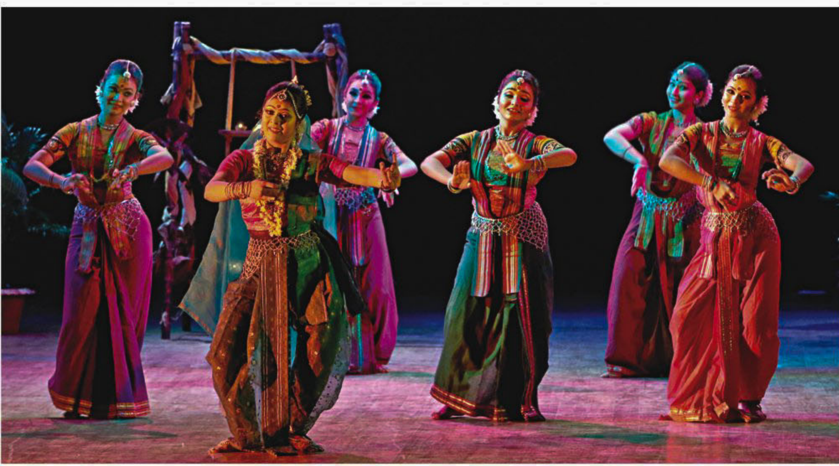
A dance sequence of Bhanushingher Padabali by artistes of Bhabna.