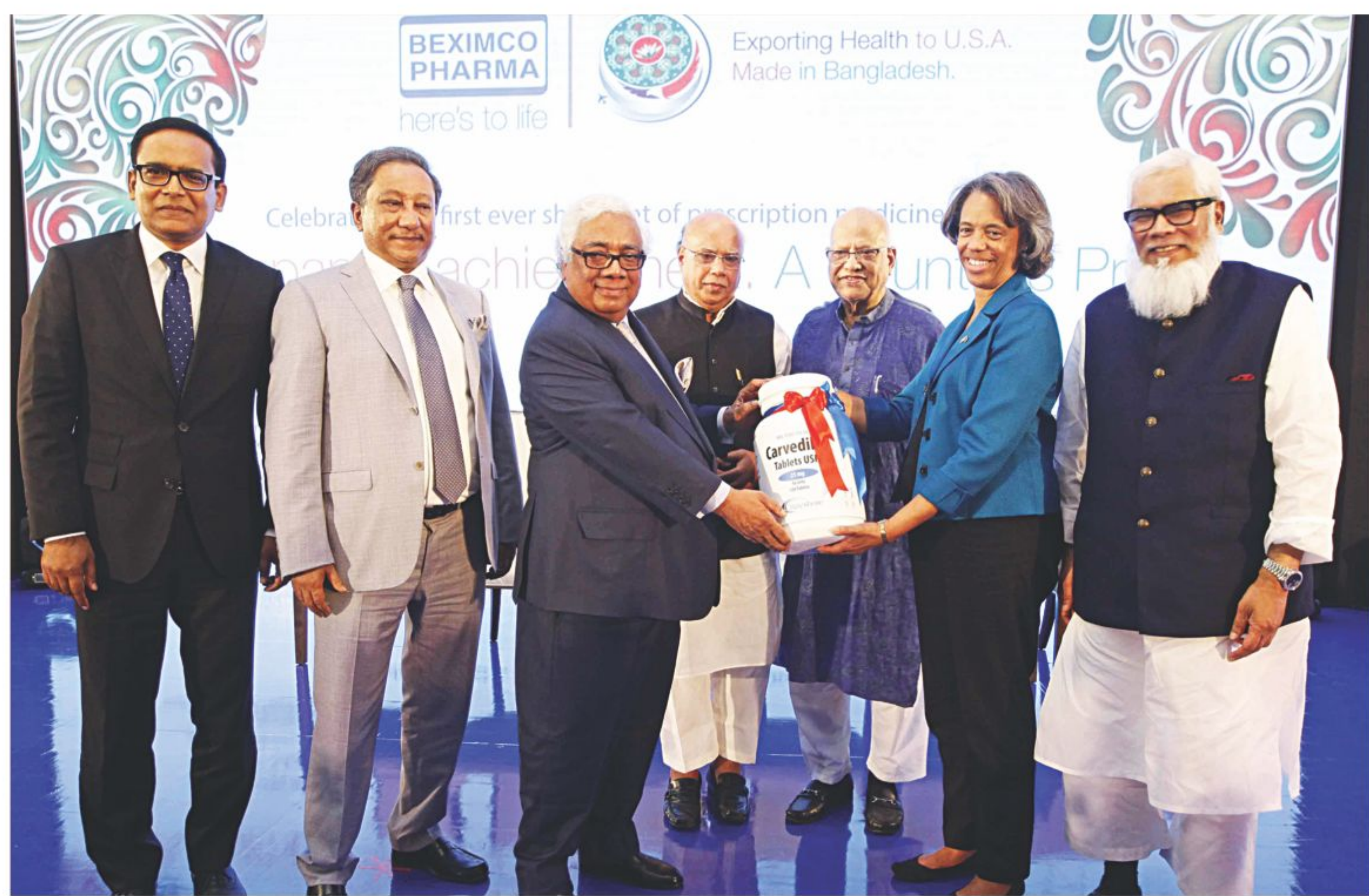
Owners of Beximco Pharma and dignitaries attend a function in Dhaka yesterday to mark the first pharmaceutical shipment of the local drugmaker to the US market.