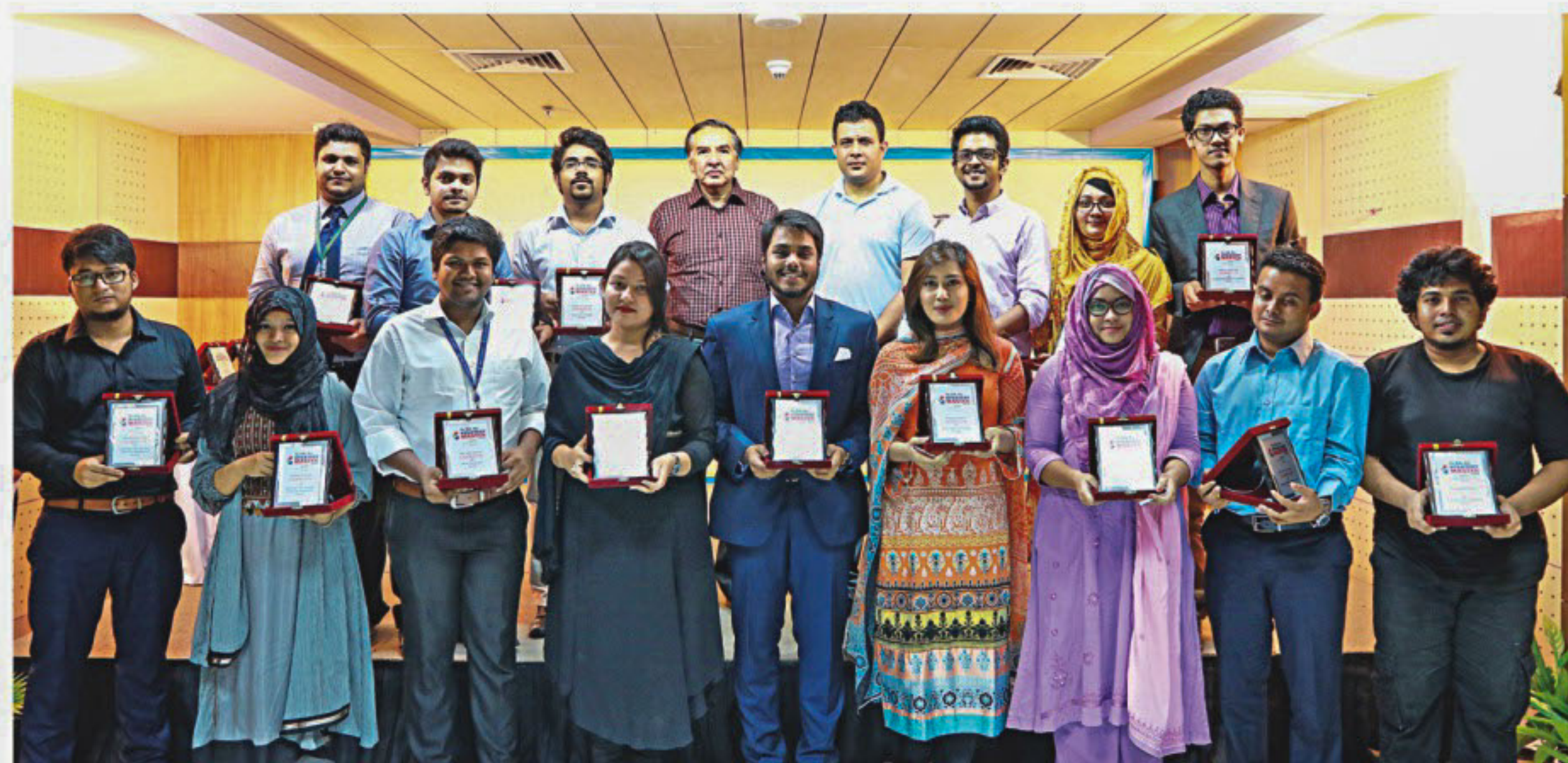
The winning teams of The Daily Star Strategy Master 2016 with the organisers.