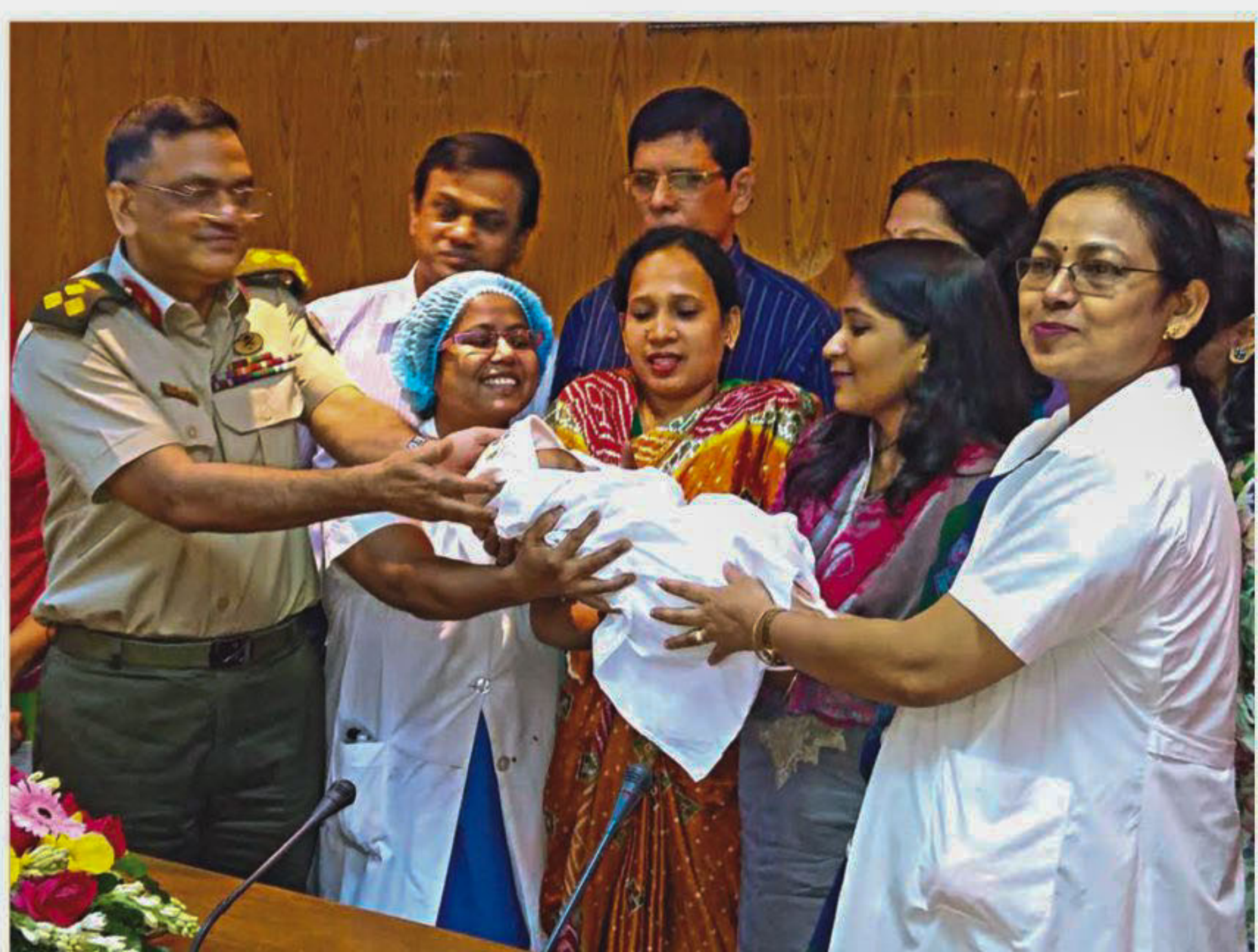
Dhaka Medical College Hospital authorities handing over the newborn to the officials of Chhotomoni Nibas at DMCH yesterday.