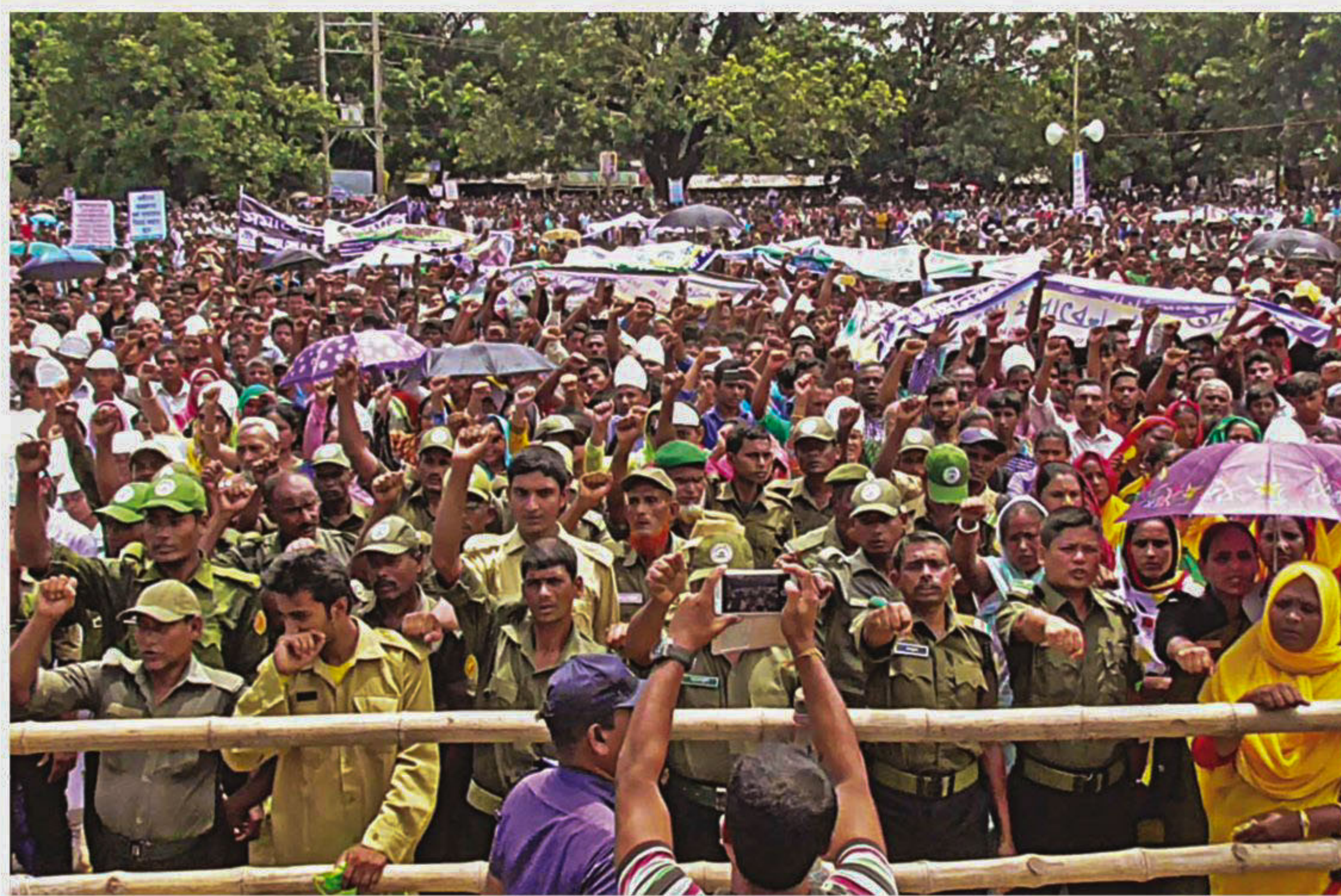
To stay against militancy, people from all strata take oath at Dinajpur Gor-e-Shaheed Boro Maidan in the town yesterday.