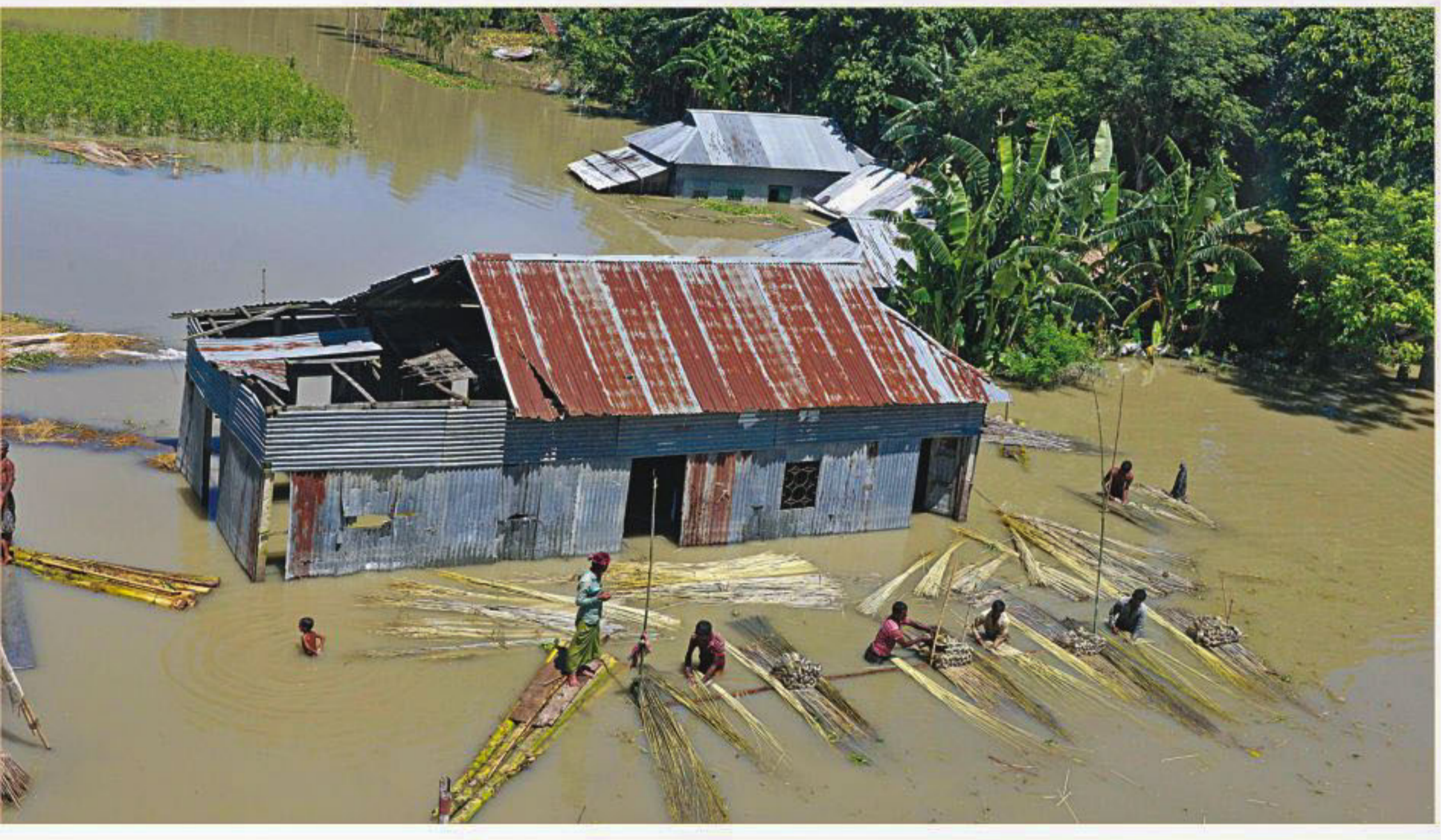
Farmers collect fibre from stems of jute plants they immersed in water bodies for rotting. Floodwaters have already washed away many of the plants. The photo was taken in Islampur upazila of Jamalpur yesterday.