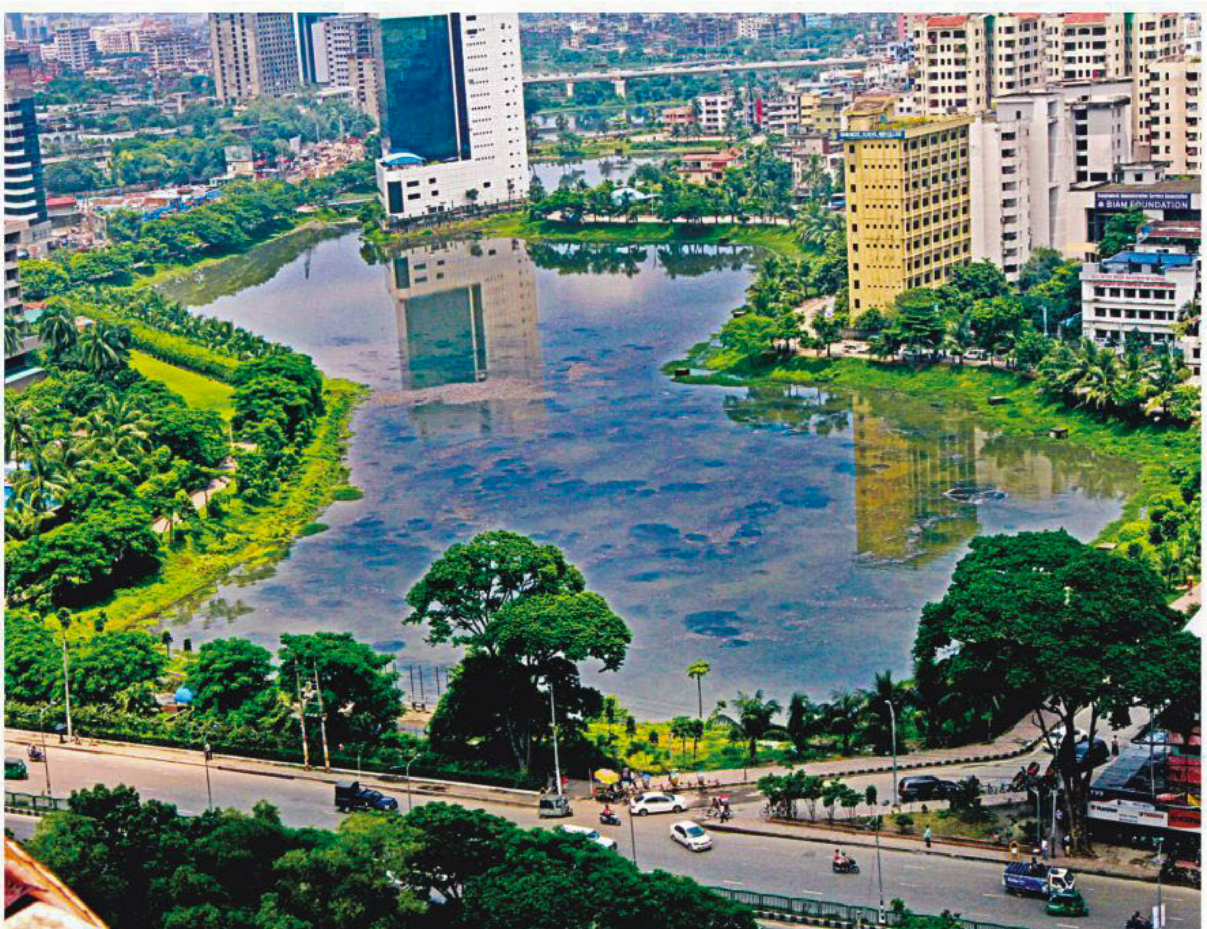
Hatirjheel was supposed to offer an eye soothing view and attract droves of visitors from across Dhaka, an overcrowded city with few open spaces like this. But the waterbody is failing in its purpose because of waste material floating on its surface and strong malodour rising off the dirty water. The photo was taken recently.