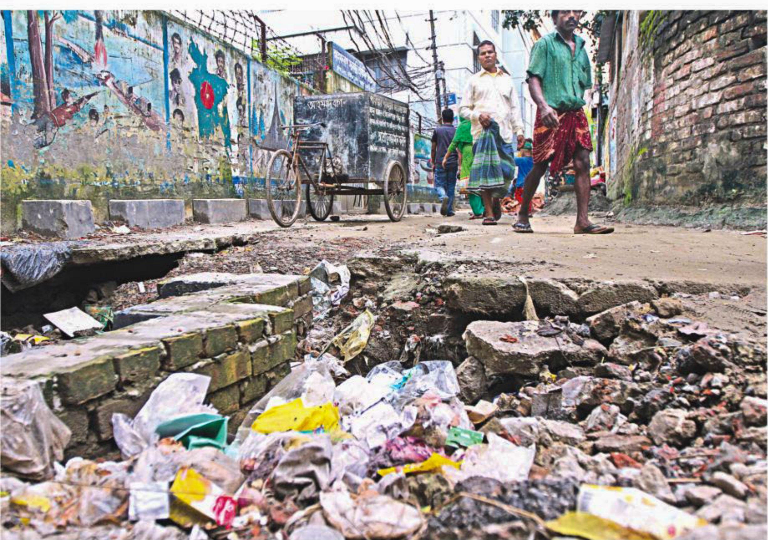
It has been over two months since the construction work and installation of sewer lines in the capital's Ahmedbagh road started, but the authorities are yet to finish their work, forcing commuters to suffer for quite a long time. The photo was taken recently.