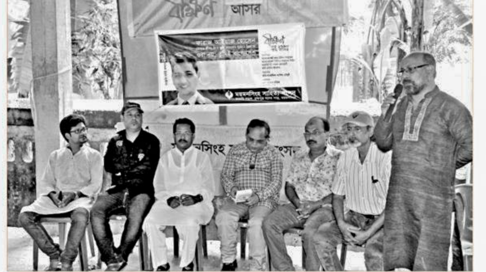
Mymensingh Sahitya Sangsad organises a discussion in Mymensingh on Friday in memory of Faraaz Ayaaz Hossain.

The title of the discussion was "Faraaz Ayaaz Hossain: By sacrificing your life, you saved us; the true Bangladesh is not in the example of the militants, but in your example."