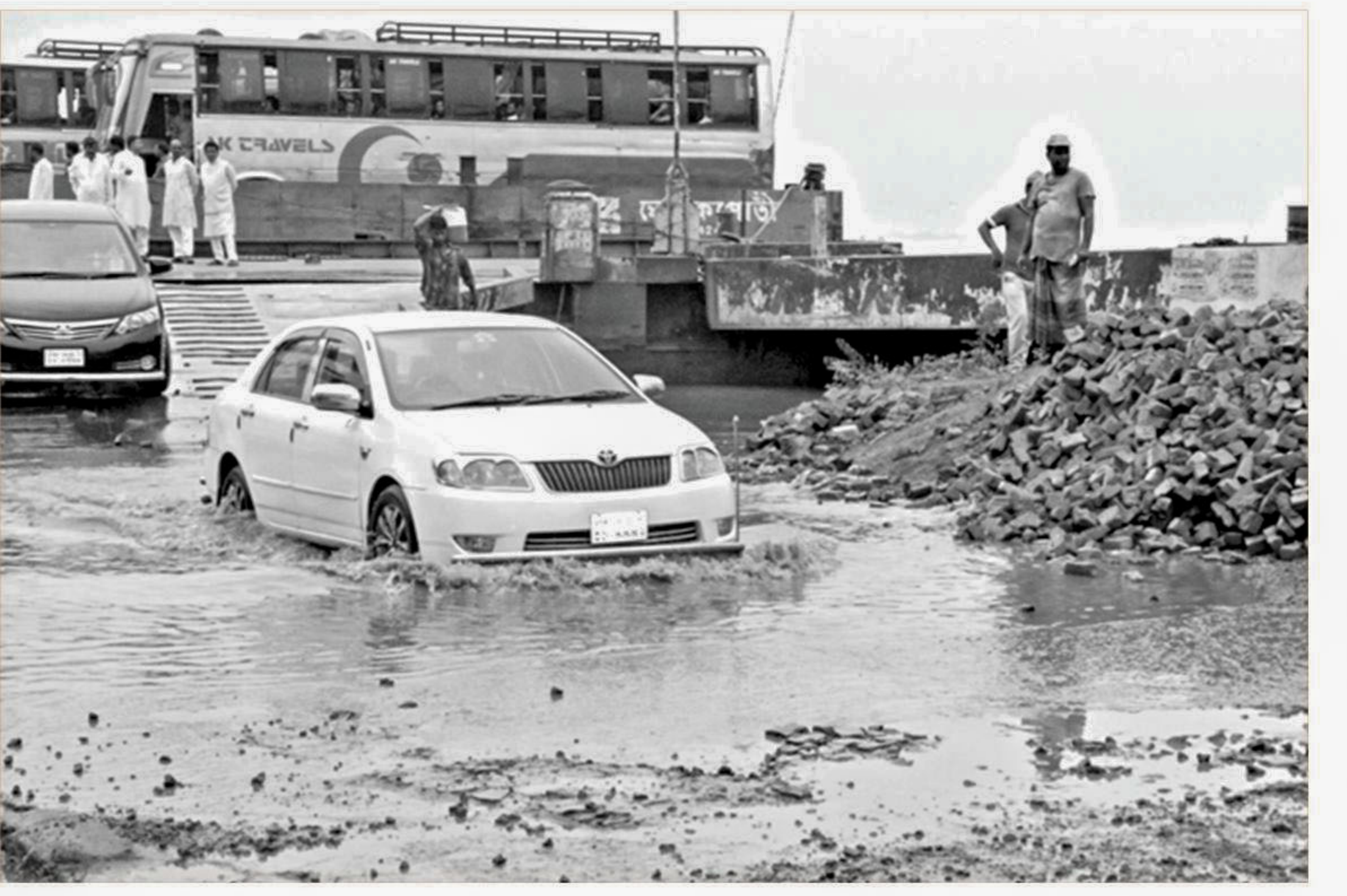
Vehicles move through water as erosion by the Padma River damages two landing stations of Daulatdia ferry terminal in Manikganj.