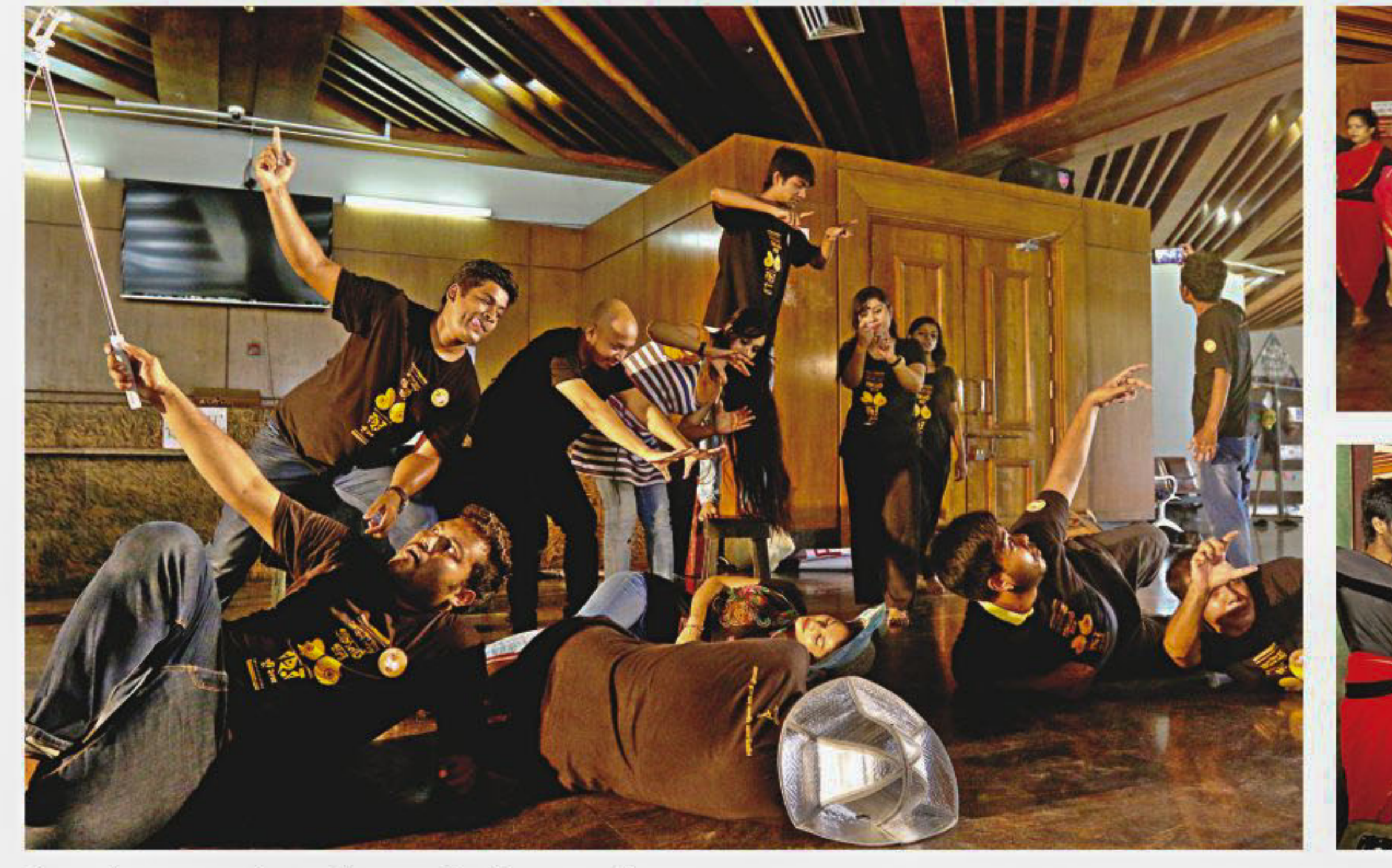
The artistes sway the audience with diverse performances.