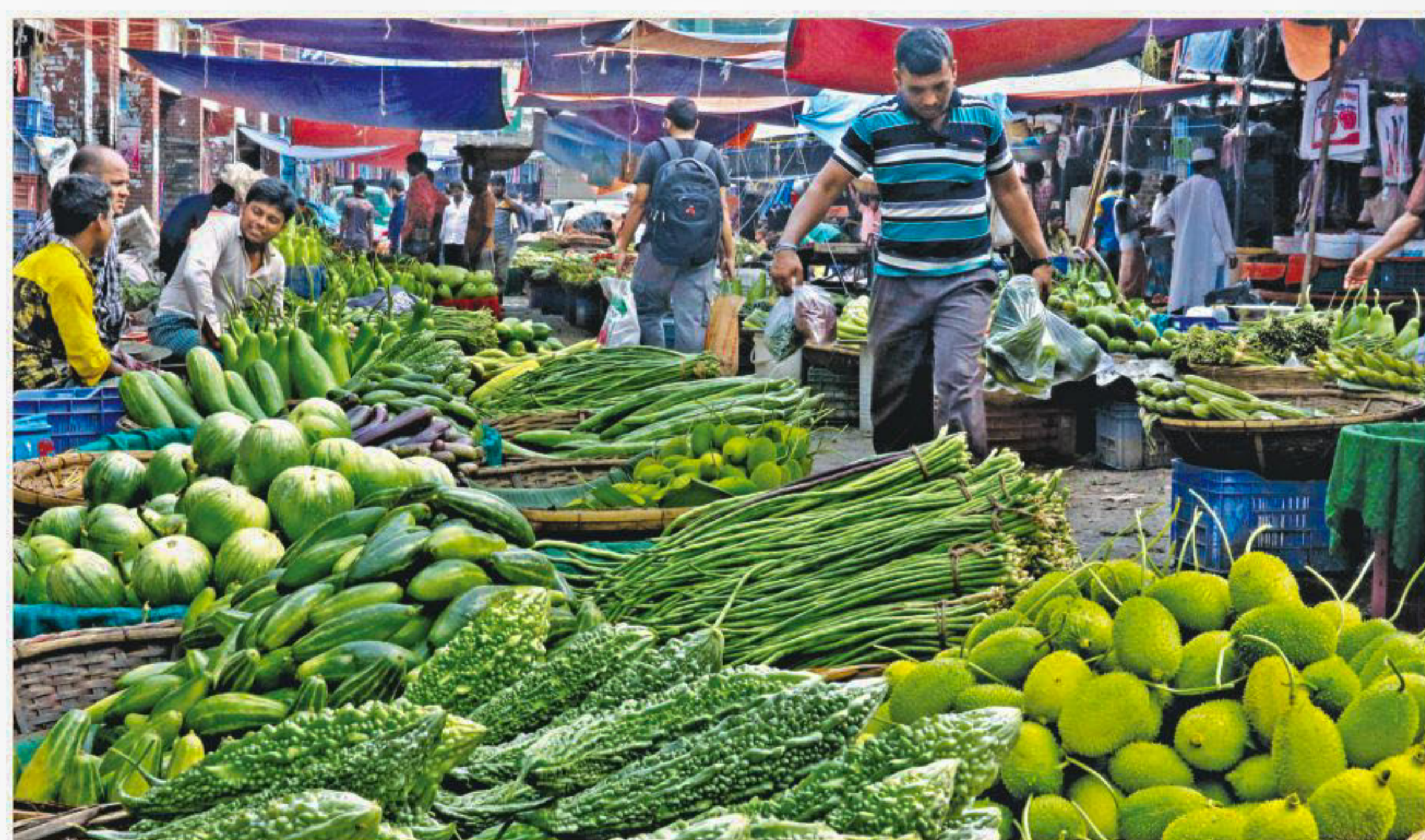
The wholesale vegetable market in the city's Karwan Bazar. Prices of vegetables here have increased. Sellers say rainfalls and floods have damaged fields in northern region leading to the price hike.