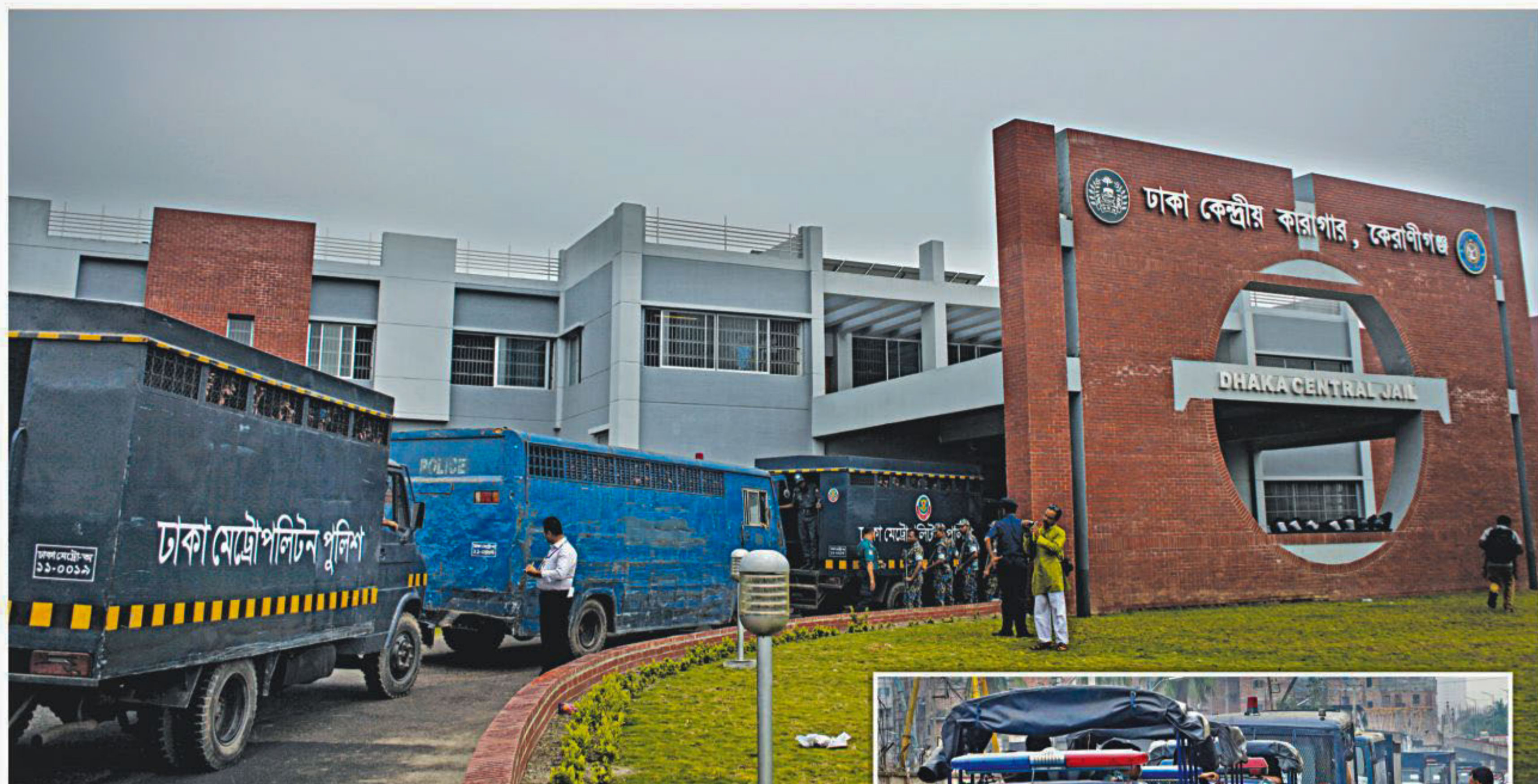
A prison van carrying prisoners from Dhaka Central Jail enters newly built jail facility in Keraniganj on the outskirts of the capital yesterday. The authorities started shifting prisoners from the 200-year-old central jail in the capital's Nazimuddin Road to the new jail inaugurated in April. Inset, a convoy of prison van under tight security on Mayor Hanif Flyover. Story on page 16.