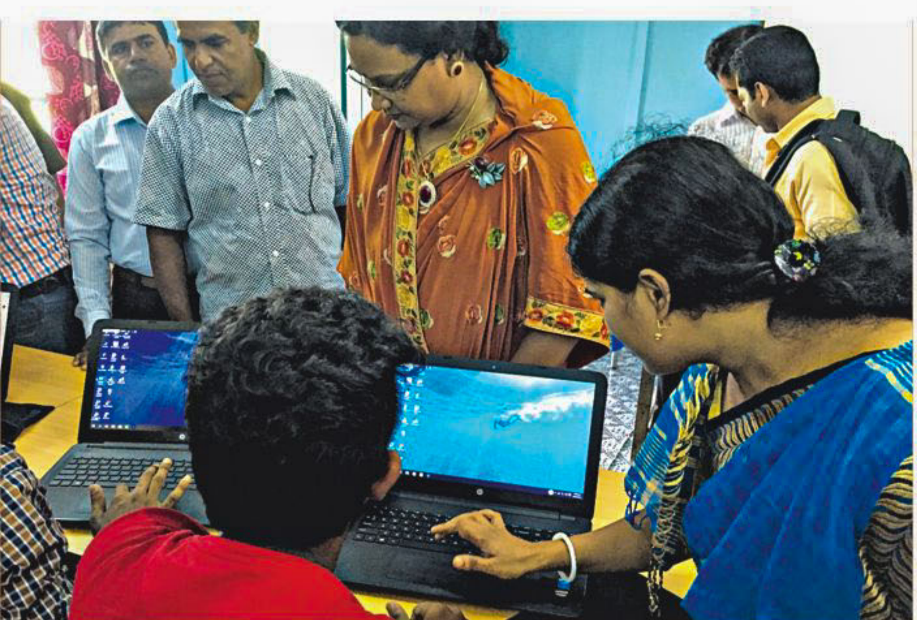
Students receive training in ICT skills at a computer lab set up at a college in Bagerhat under a countrywide project titled Sheikh Russel Digital Lab.