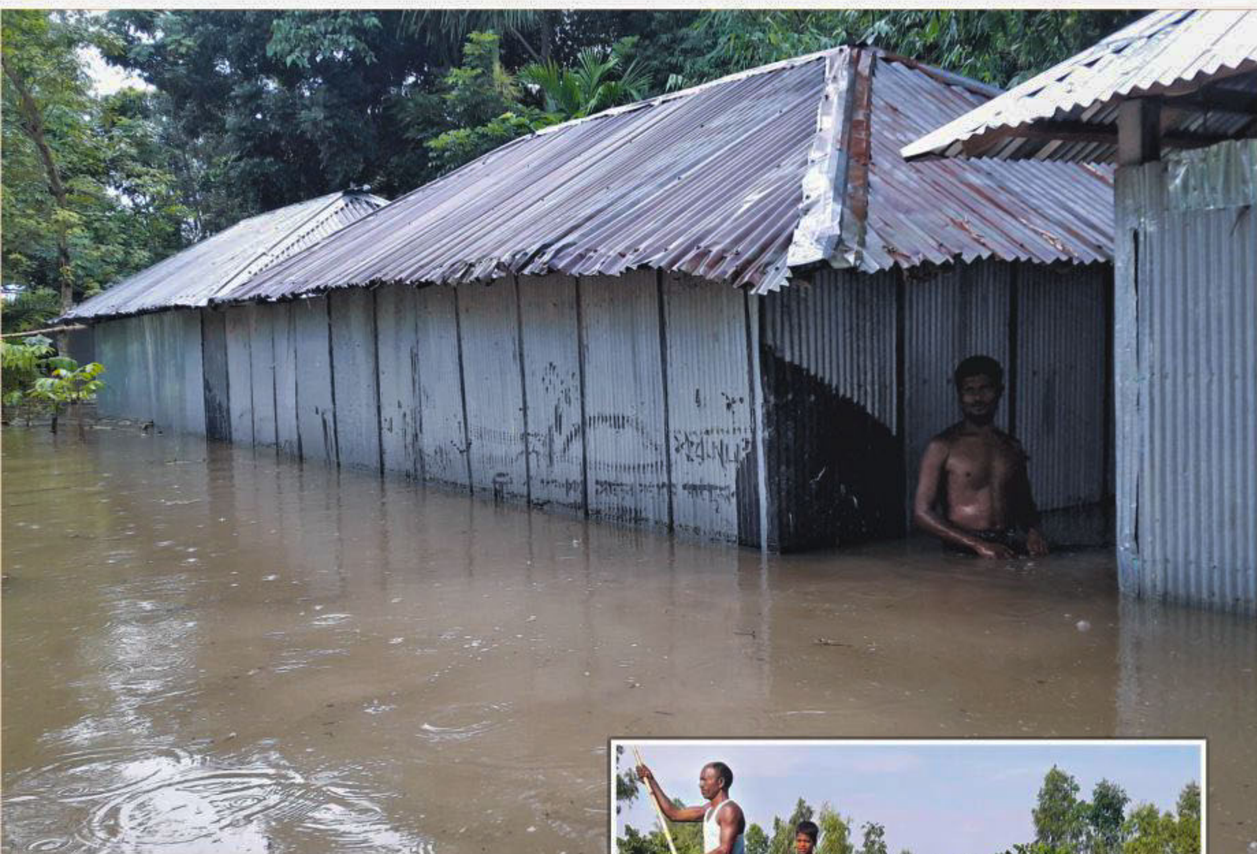
Flood situation in Lalmonirhat Sadar upazila has worsened with new areas going under water. In the photo, a man stands in waist-deep water in front of his home in Shiberkuti village, which has been inundated after the Dharla river washed away a large portion of a dam there. Inset, a man taking cattle to safety at a flood-hit village in Sirajganj Sadar upazila.