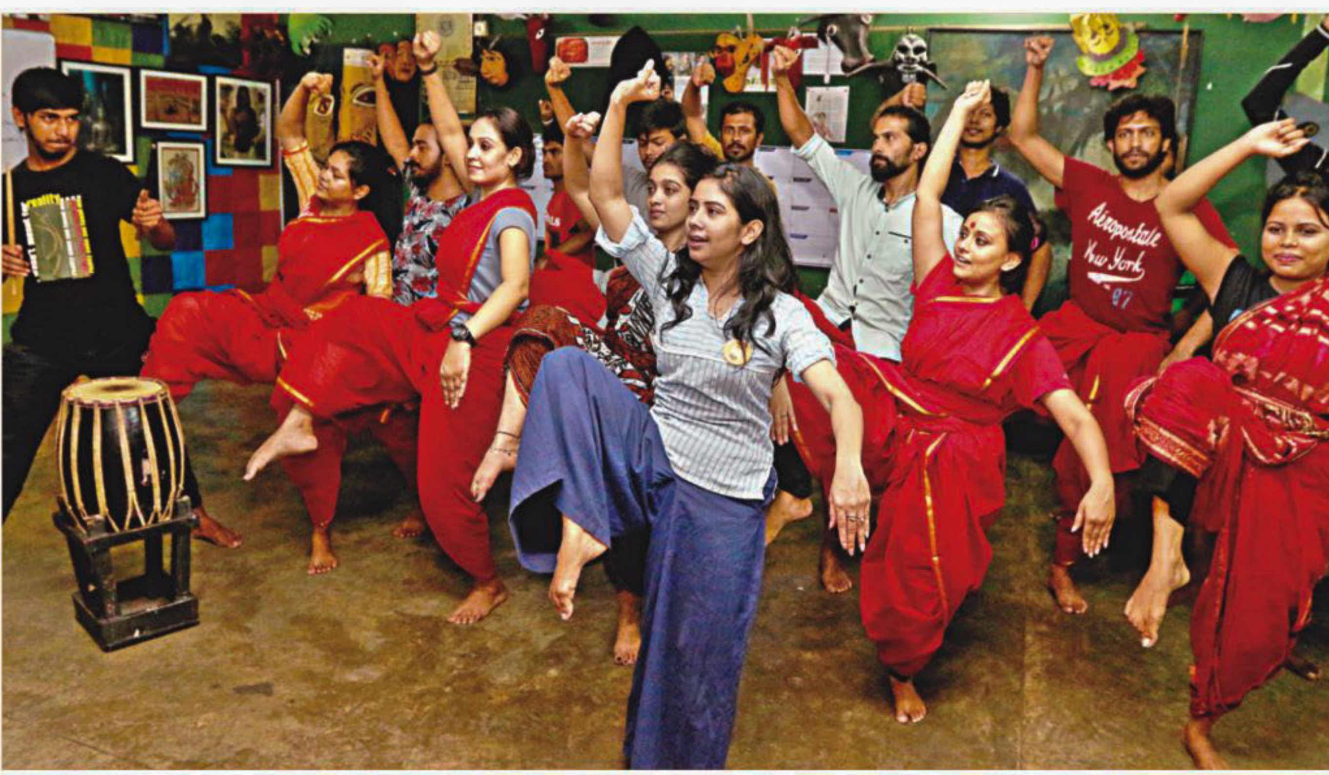
Artistes rehearse in full swing.