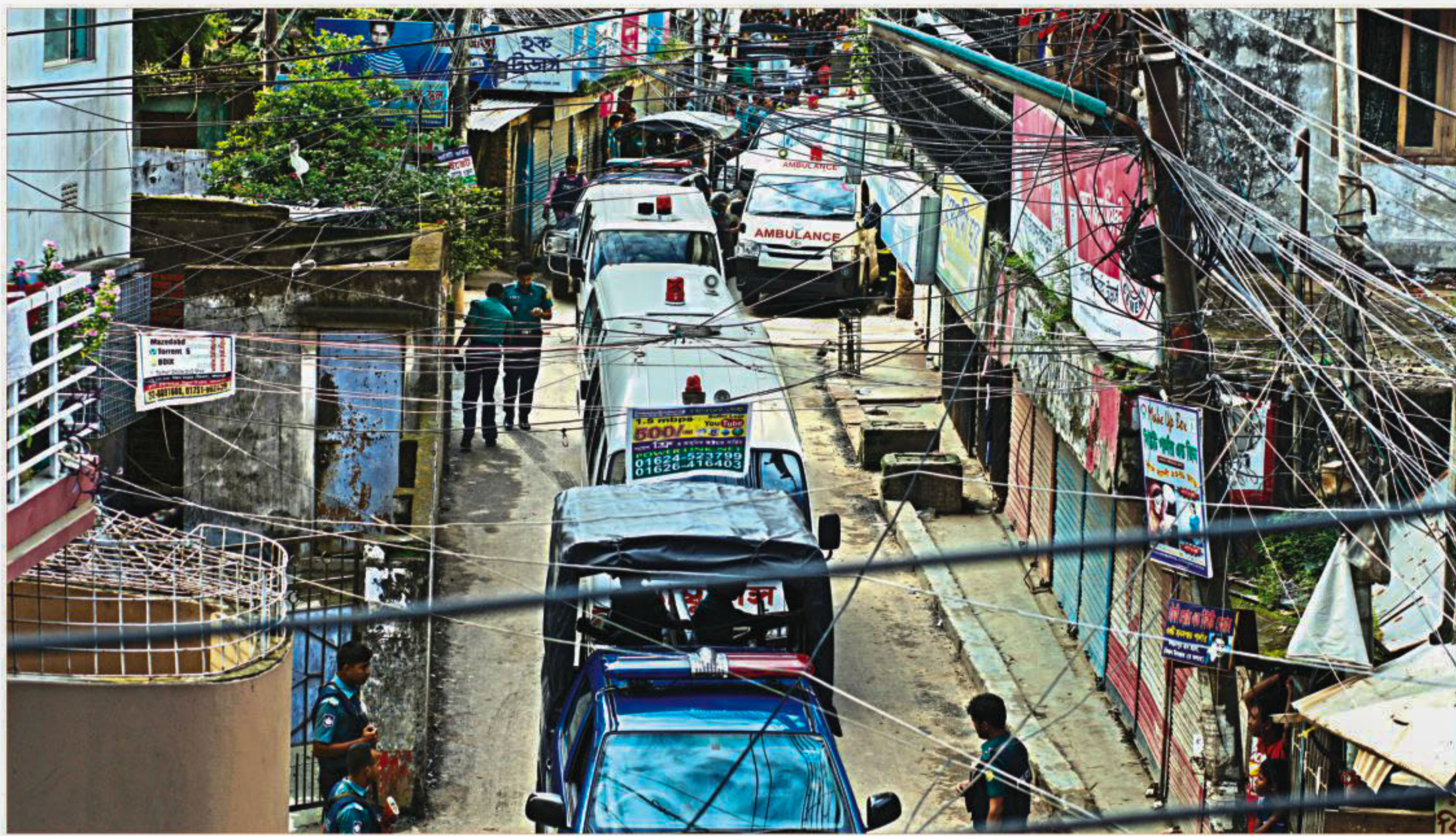
Ambulances carrying bodies of nine suspected militants leave Kalyanpur for Dhaka Medical College Hospital yesterday afternoon for autopsies.