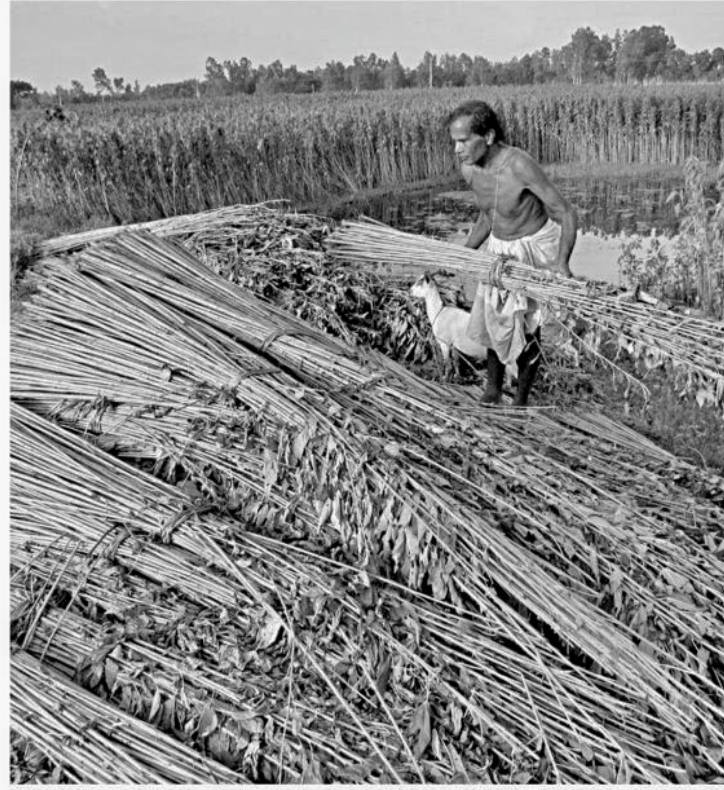
Farmers reap and process jute at Mujaborni, left, and Bothina village in Sadar upazila of Thakurgaon district that sees good yield of the cash crop this season.

"Upon receiving information, we would verify it and definitely make a correction in the list," he said.