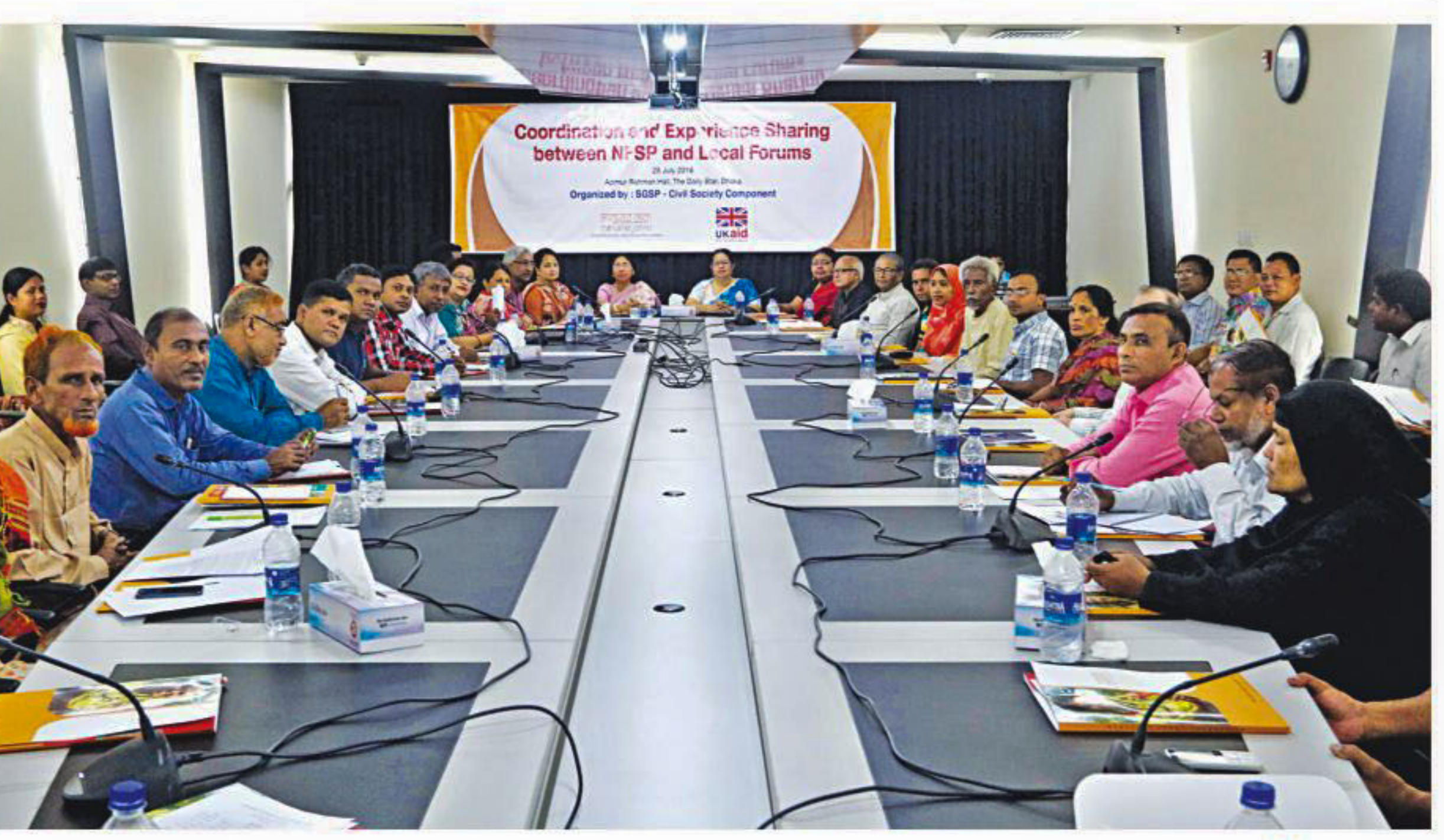
Participants at a programme titled 'Coordination and Experience Sharing between NFSP and Local Forums' at the capital's The Daily Star Centre yesterday, organised by SGSP - Civil Society Component, in cooperation with UKaid.