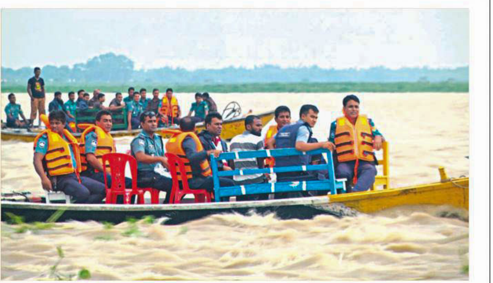
Members of police and Border Guard Bangladesh on their way to one of the chars of Padma during an anti-militancy drive in Rajshahi yesterday. According to the officials, five people were held during the raid and the joint forces also seized 200 grams of ganja (hemp).