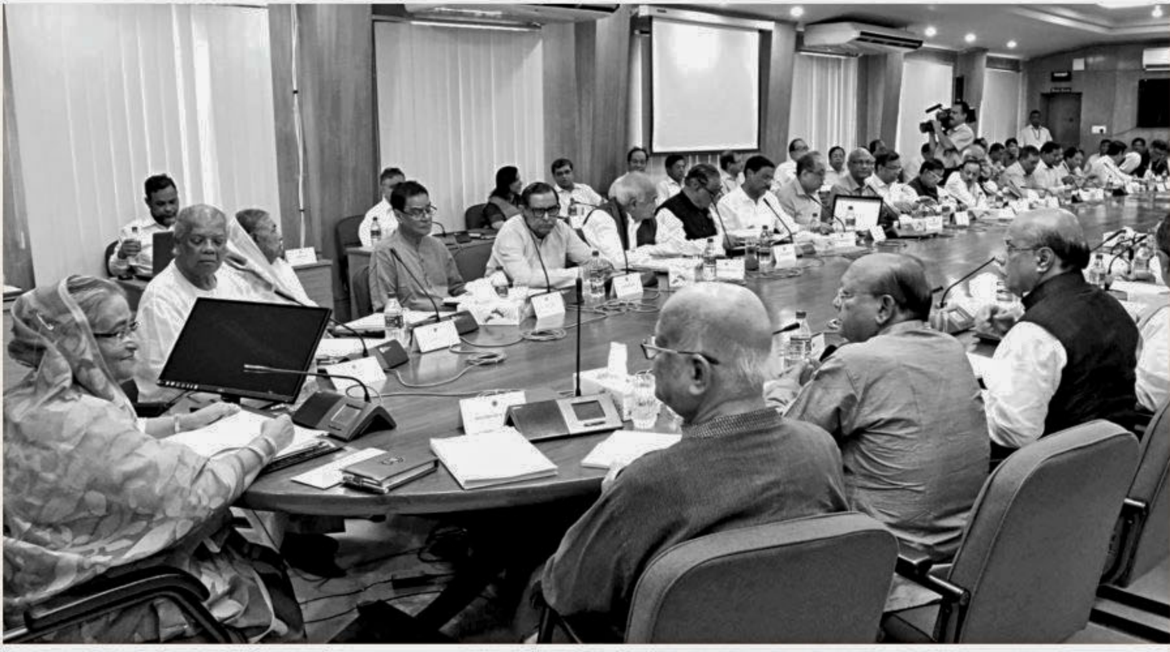
Prime Minister Sheikh Hasina presiding over the cabinet meeting at Bangladesh Secretariat in the capital yesterday.

India is expected to offer exchange of professional expertise and training of security and law enforcement personnel, he said.