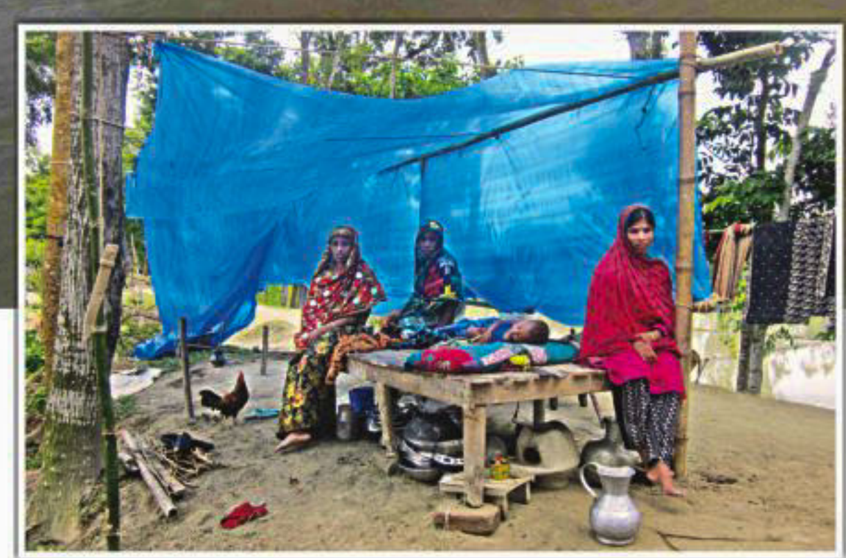
A road in Doarabazar in Sunamganj went under floodwater yesterday. Inset, a flood-hit family has taken shelter in the open on an embankment at Shanyashi village in Kurigram. Weather forecast says the flood situation in several northern and north-eastern districts could deteriorate if the rain and the onrush of water from hills continue.