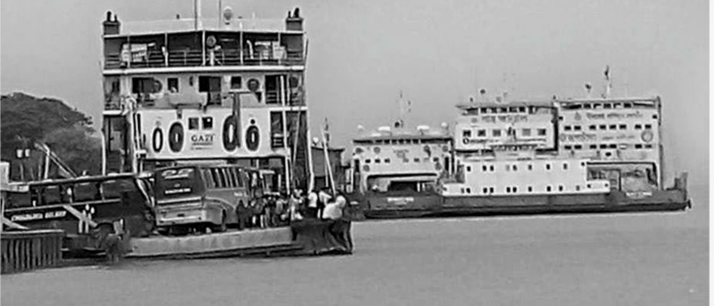
A large number of vehicles lie stranded at Shimulia ferry terminal on the Meghna in Munshiganj district, top, and Paturia on the Padma in Manikganj, middle, while five dysfunctional ferryboats lie anchored for repair at floating dock Modhumati near Paturia terminal yesterday.