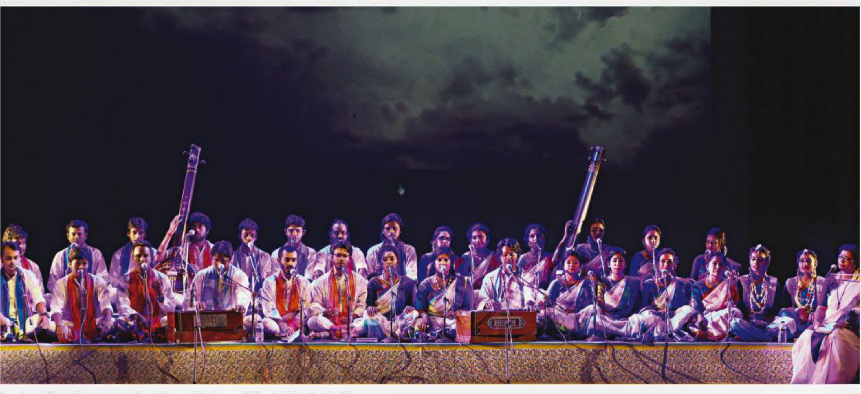
A choral performance by the artistes of Govt. Music College.