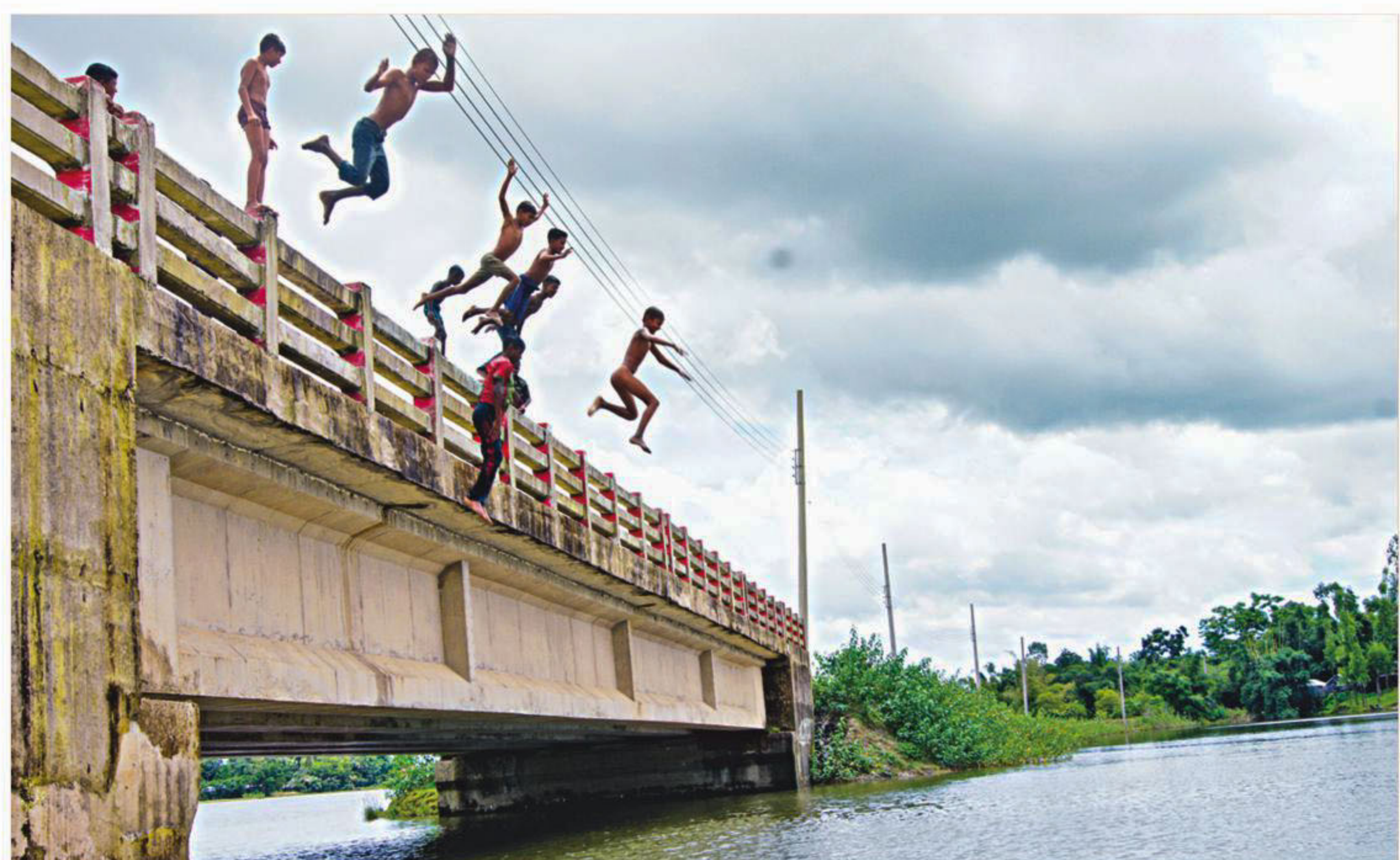
Merely walking into a water body for a swim clearly does not appeal to these young thrill-seekers aiming to ward off the sweltering midday heat by taking a dip in the cooling waters of Chamaura Kandi Haor in Sylhet sadar upazila on Saturday.