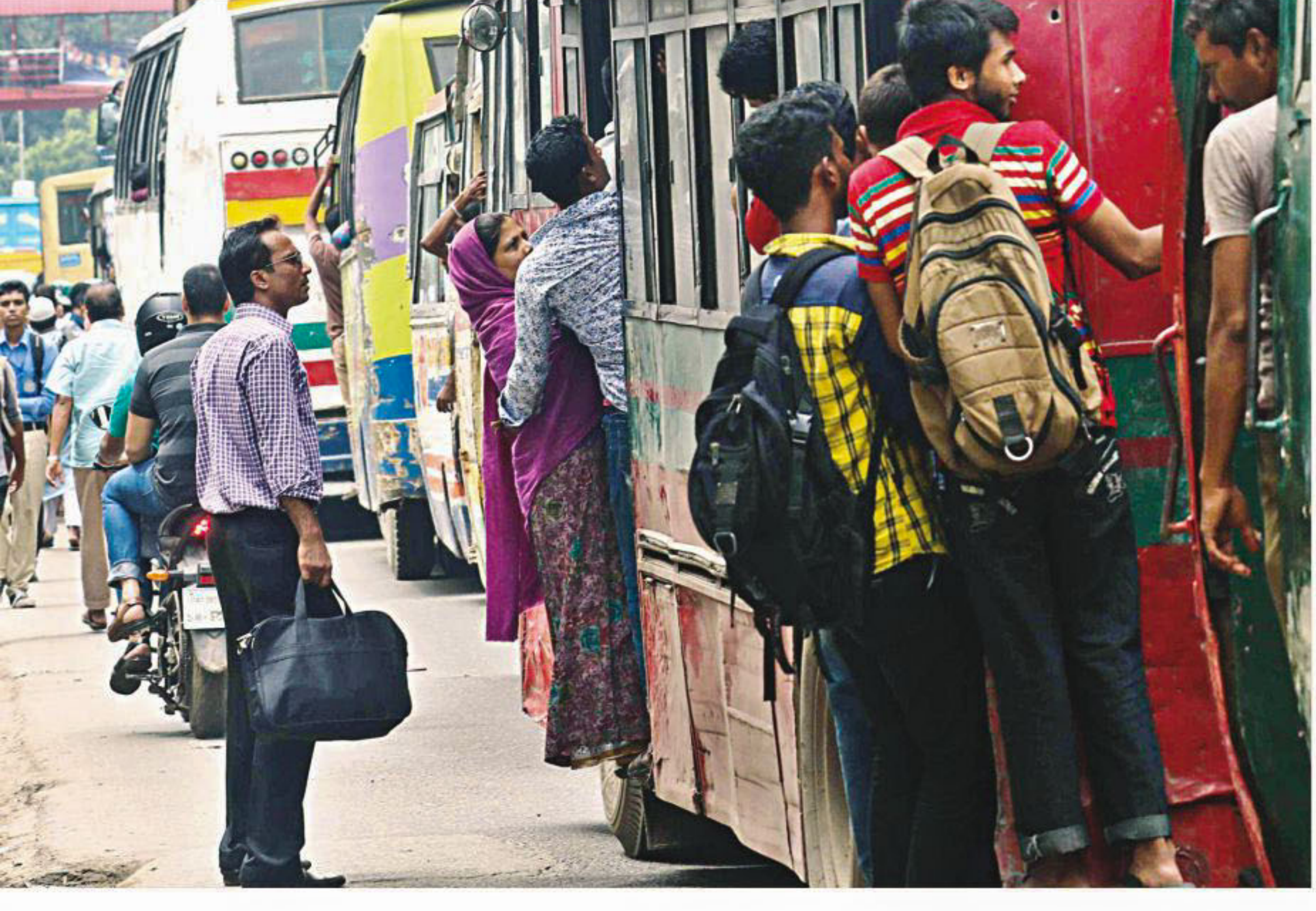
Passengers hang precariously from a crammed bus while a few try their luck to squeeze inside. This has become a regular scene in the capital especially during the afternoon when students and home-goers swarm these buses, which may lead to a serious accident anytime. The photo was taken at Farmgate yesterday.