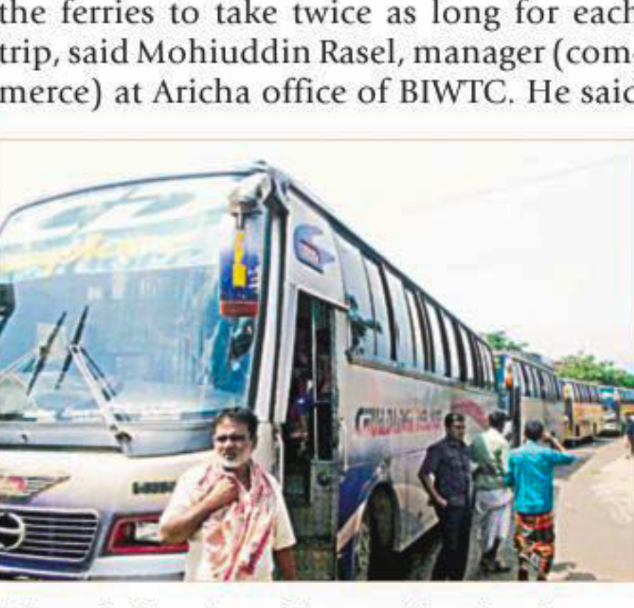
A long tailback on the road leading to Paturia terminal in Manikganj yesterday.