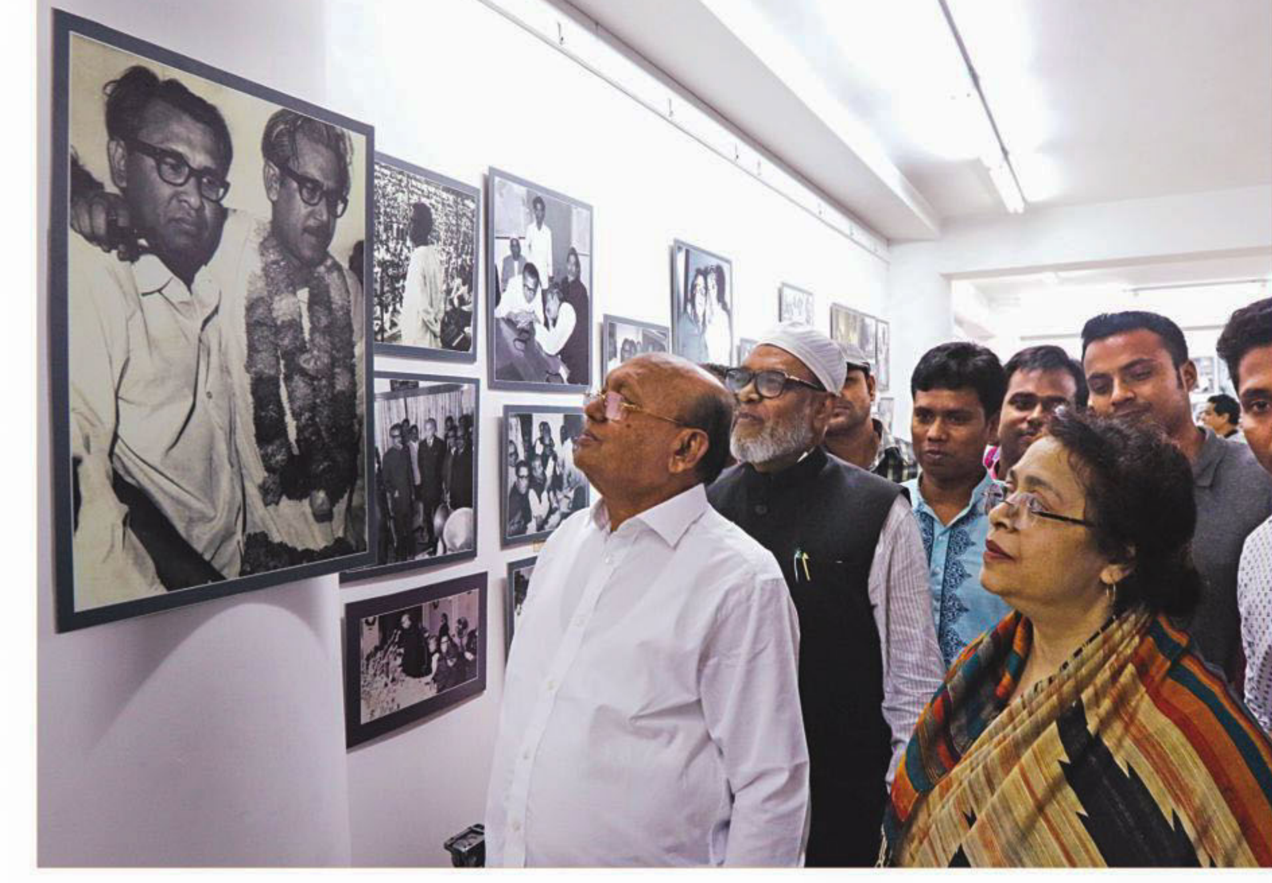
Visitors look at photos at an exhibition at Gallery Twenty One on Satmasjid Road in the capital's Dhanmondi yesterday, marking the 91st birthday of national leader Tajuddin Ahmad. Commerce Minister Tofail Ahmed and Liberation War Affairs Minister AKM Mozammel Haque inaugurated the month-long event on the day, which will remain open from 11:00am to 4:00pm every day.

the number of vehicles crossing the river every day was reduced to half due to the ferry shortage and strong currents. An estimated 4,500 vehicles make the crossing daily. Meanwhile, thousands of passengers from 17 south-western districts of the country, heading for Dhaka, were experiencing immense sufferings due to the tailbacks.