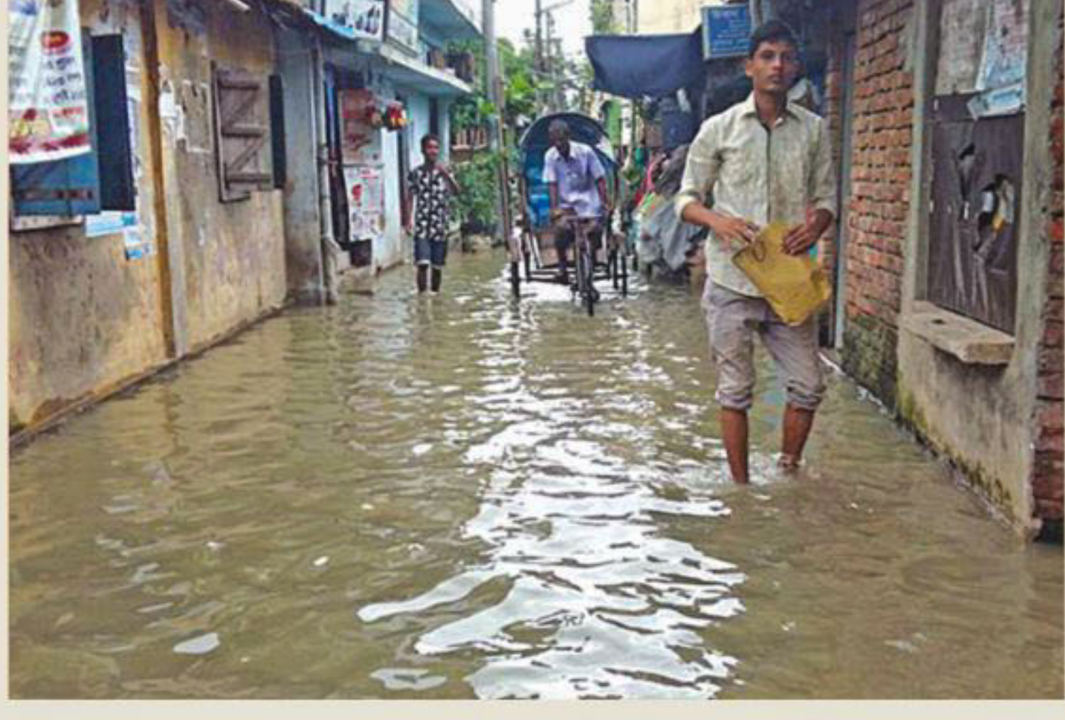
Locals wade through ankle-deep murky water in Adarshapara, one of the affected areas.