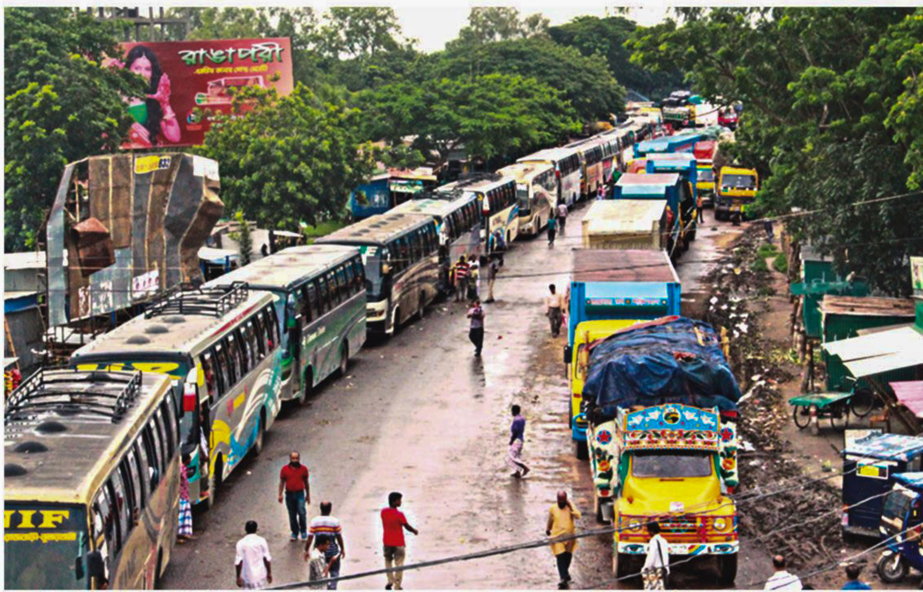
Vehicles stuck in long tailbacks at Paturia terminal yesterday amid disruption of ferry services on Paturia-Daulatdia route due to strong currents in the Padma and shortage of ferries in operation.