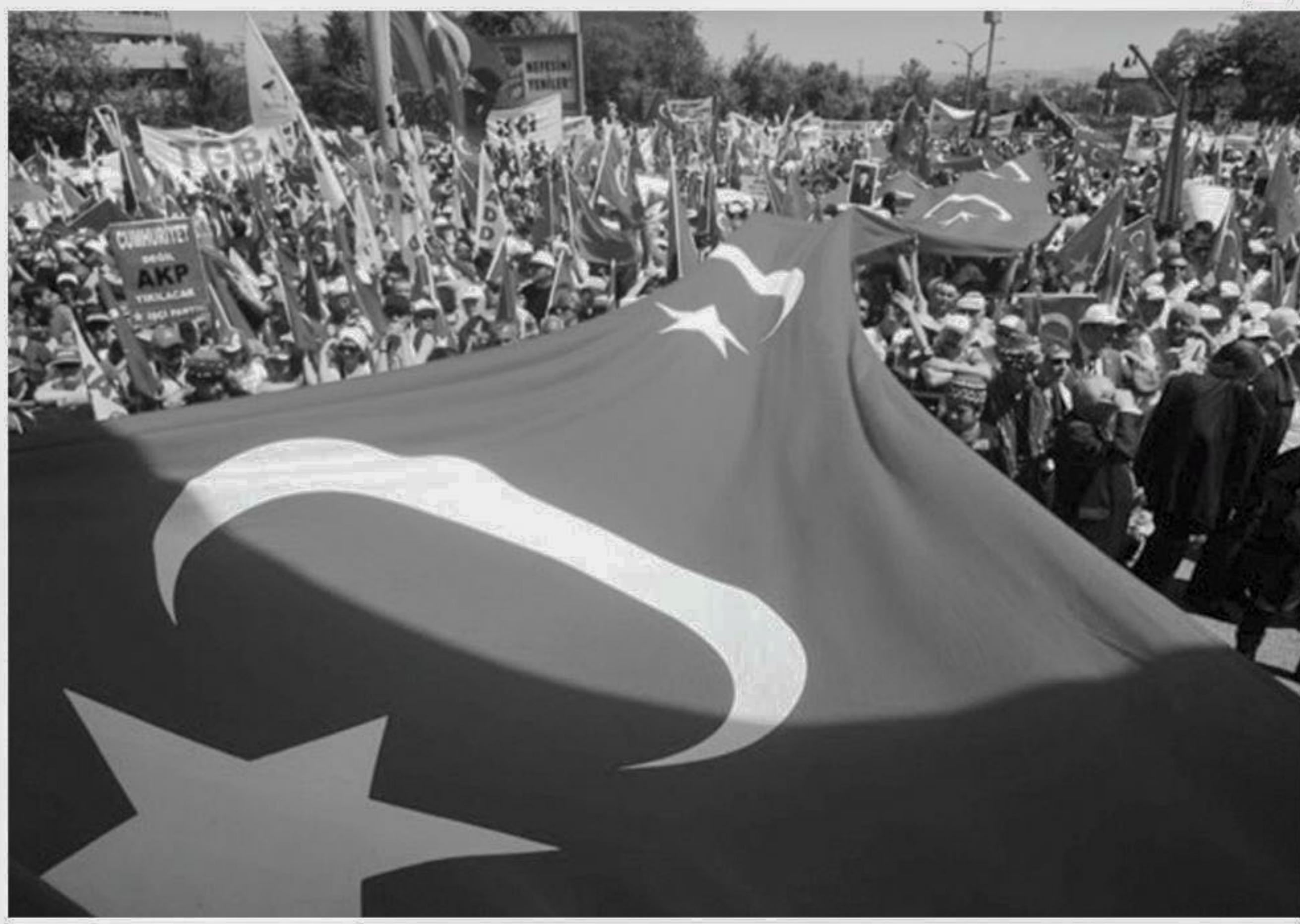
Where will Turkey go from here?

Turkey, steeped in a history of military interventions suddenly found