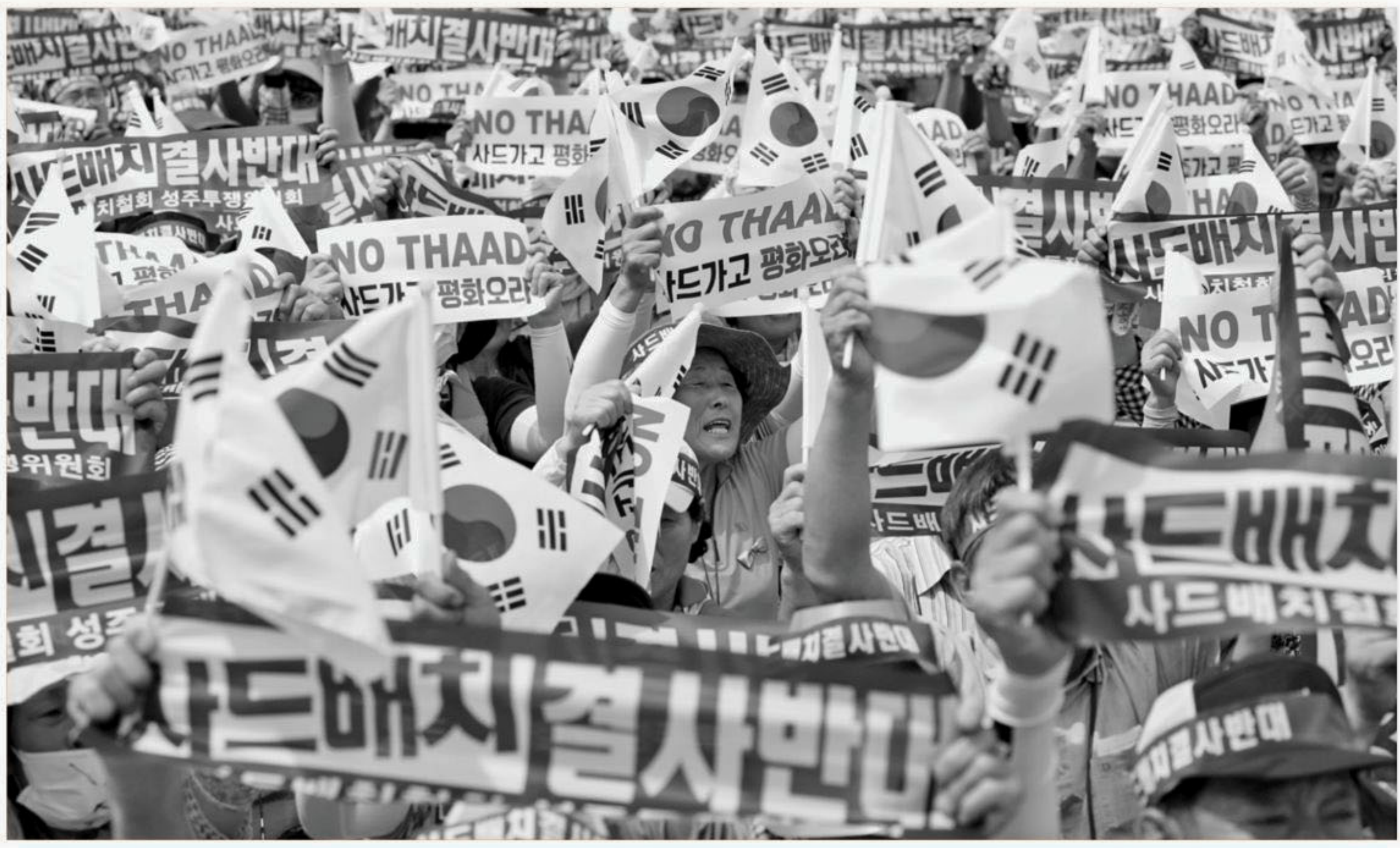
Seoungju residents chant slogans during a protest against the government's decision on deploying a US THAAD anti-missile defense unit in Seoungju, in Seoul, South Korea, yesterday. The banner reads "Desperately oppose deploying THAAD". But President Park Geun-Hye insisted the move was a national security imperative.

Thai authorities have ordered an anti-junta television channel to stop broadcasting as the kingdom's military rulers tighten the screw on dissent ahead of a controversial referendum vote. The junta has banned campaigning ahead of an August 7 plebiscite on a new draft of a charter in what will be the first public vote of any kind since the military seized power two years ago.