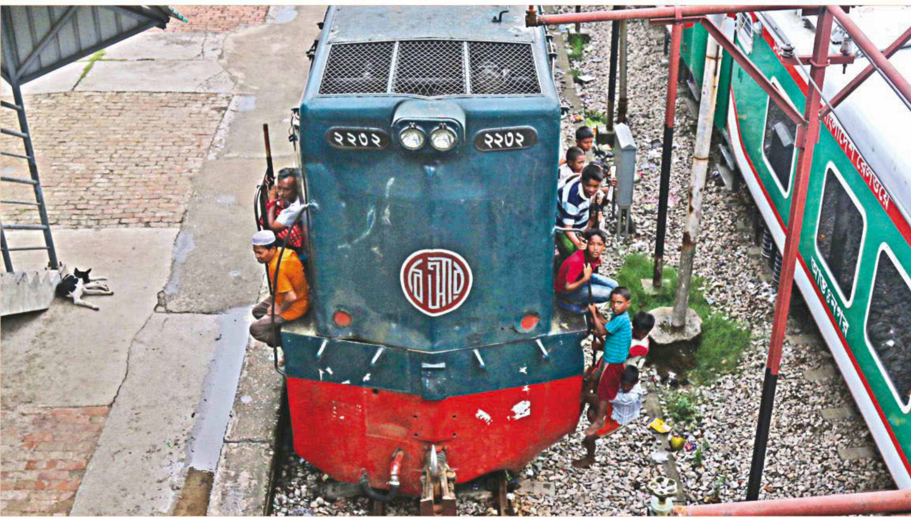
A group of kids ride towards the railway station, clutching onto the exterior buffer beam of the trailing locomotive, putting their lives at risk. Many of such riders lost their limbs, in some cases died, falling from the speedy trains. The photo was taken yesterday at Chittagong Railway Station.