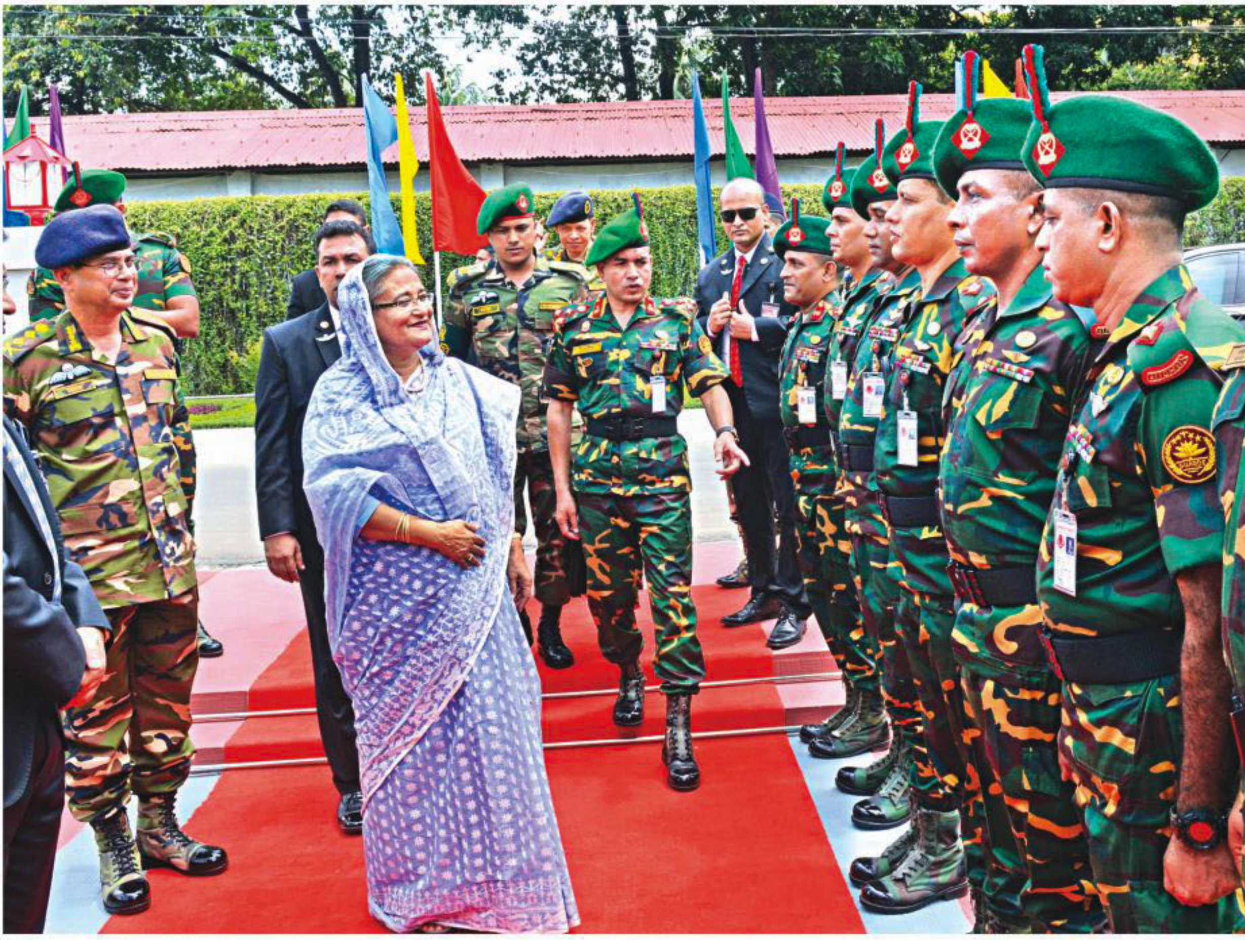
Prime Minister Sheikh Hasina with army officials at President Guard Regiment Headquarters in Dhaka Cantonment yesterday, marking the regiment's 41st founding anniversary.