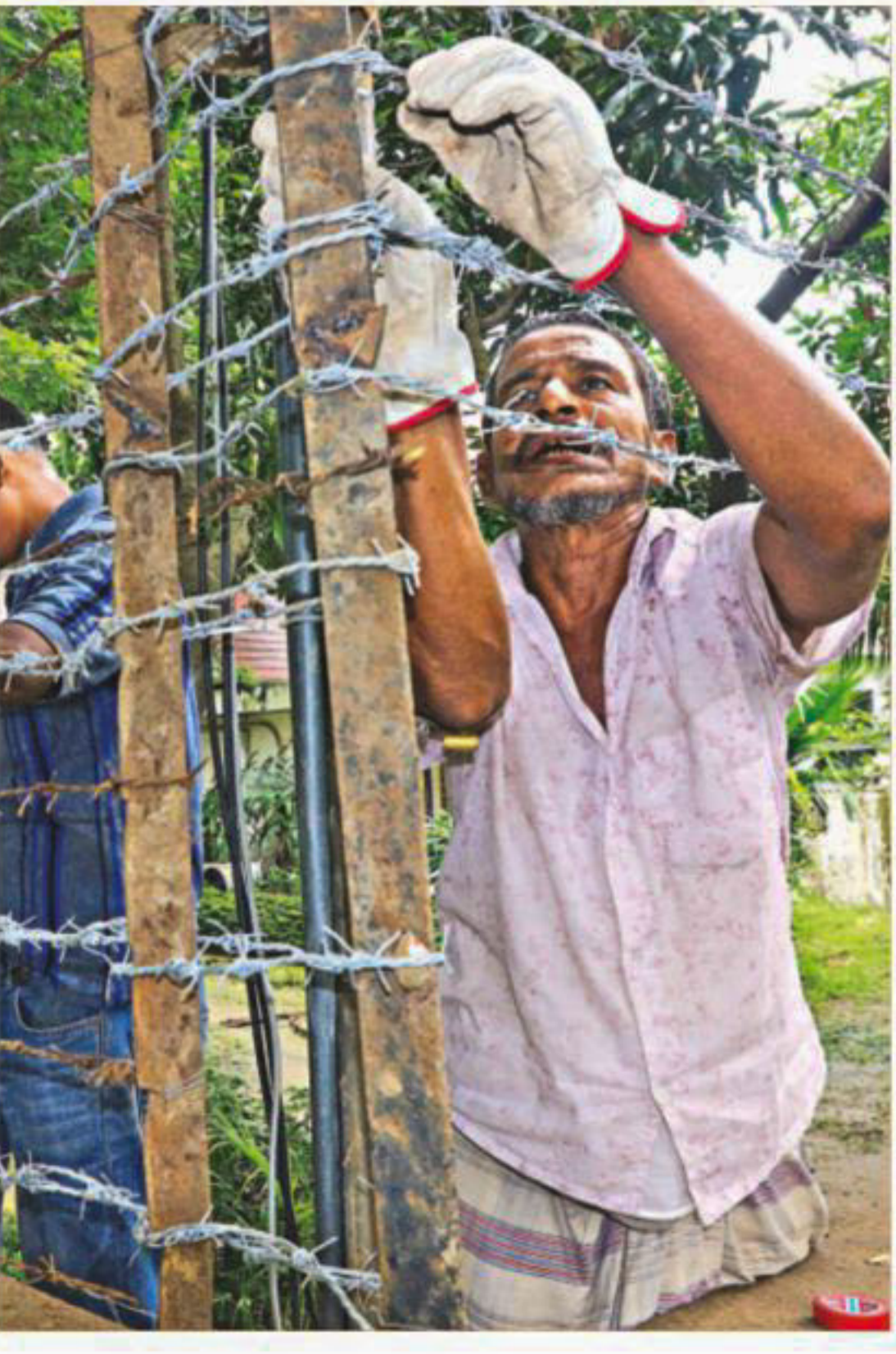
Security measures have been tightened all over the capital due to the recent militant attacks. Clockwise from top, police stand guard in front of Jatiya Press Club. Barbed wire being installed over the walls of a house on Road 80 in Gulshan. Two policemen check a bag of a motor biker in front of Jamuna Future Park. Law enforcement personnel inspect a private car at the airport. The photos were taken yesterday.