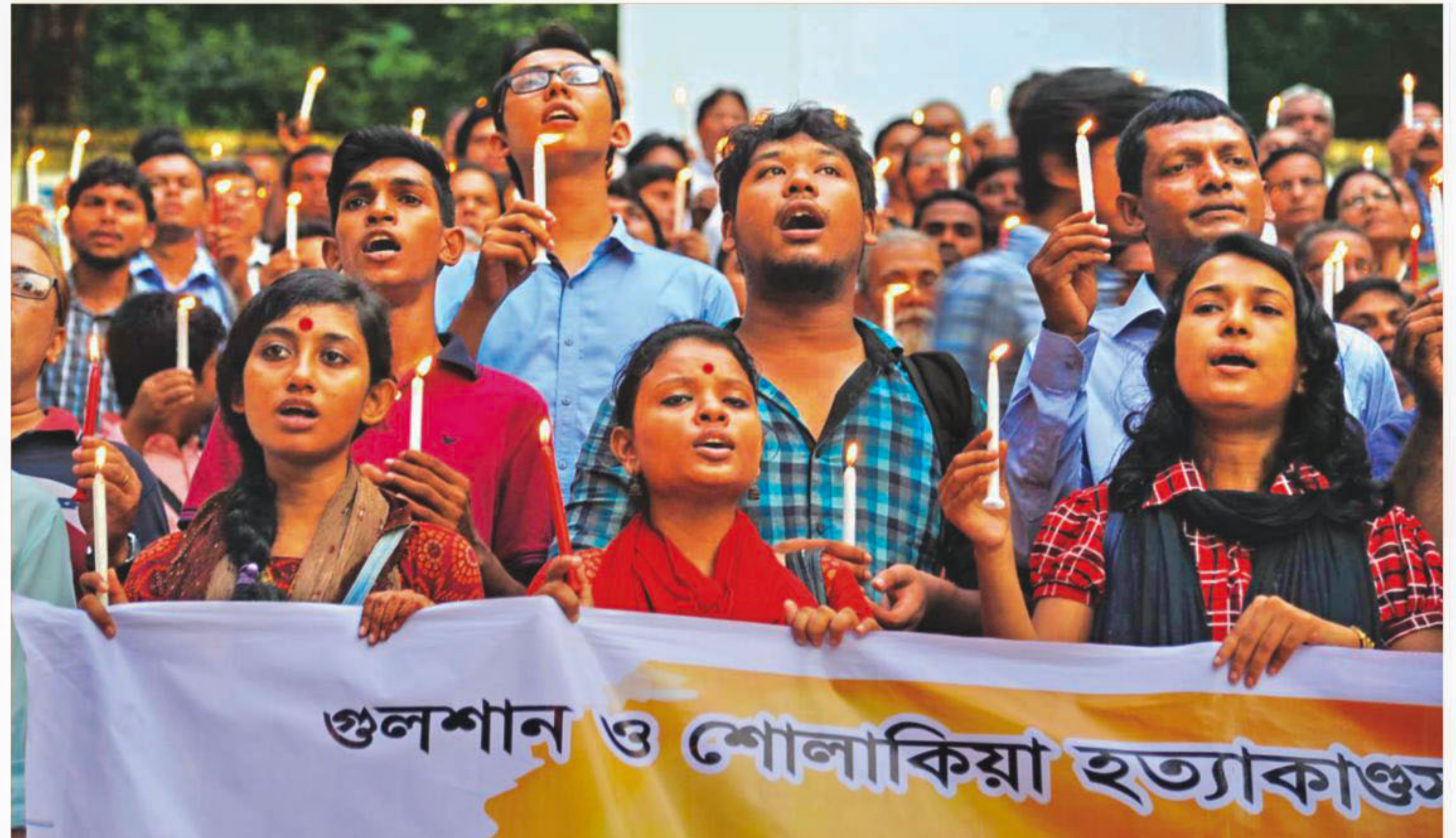
With a call for national unity, people from all walks of life hold a candlelit procession in front of the Chittagong Central Shaheed Minar in the port city yesterday, protesting the recent militant attacks in the capital's Gulshan and Sholakia in Kishoreganj.

On June 20, 2013, a Dhaka court sentenced 10 members of JMB to death for carrying out the attack.