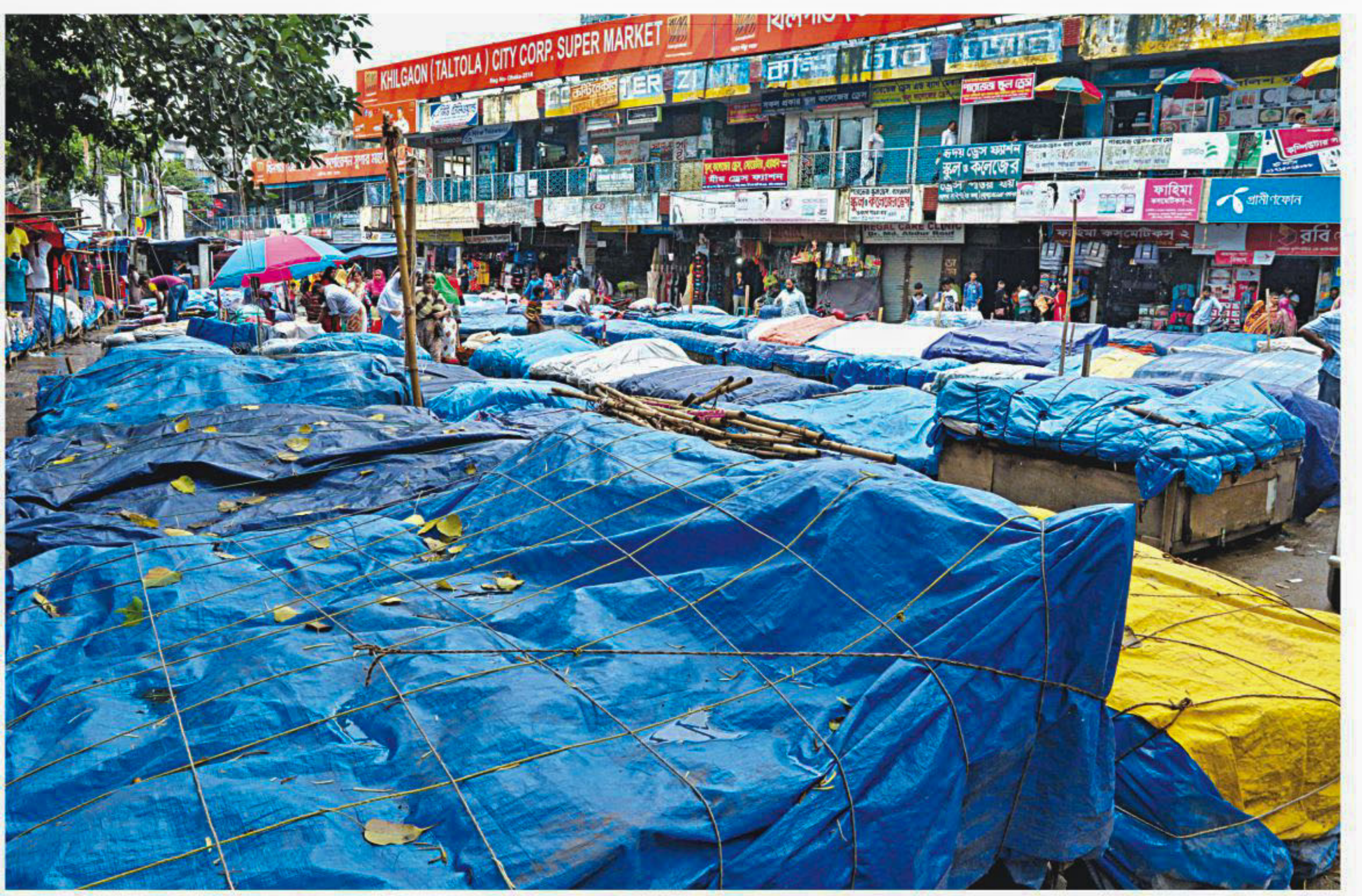
Hawkers have set up shops at the parking lot of Khilgaon Taltola City Corporation Super Market in the capital, thanks to lax enforcement of law. Shoppers always struggle to find a parking space around the market. The photo was taken yesterday when the shops were closed due to intermittent rain.