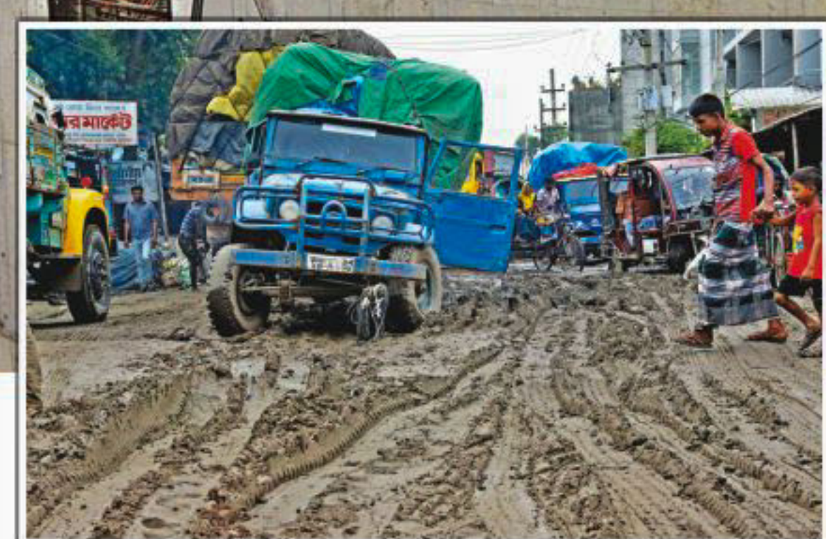
The under-construction Central Effluent Treatment Plant at Savar Tannery Industrial Estate in Hemayetpur of Savar. Inset, the Bagbari Shyampur Road, around half a kilometre off the estate, is in a very bad shape. The photos were taken yesterday.