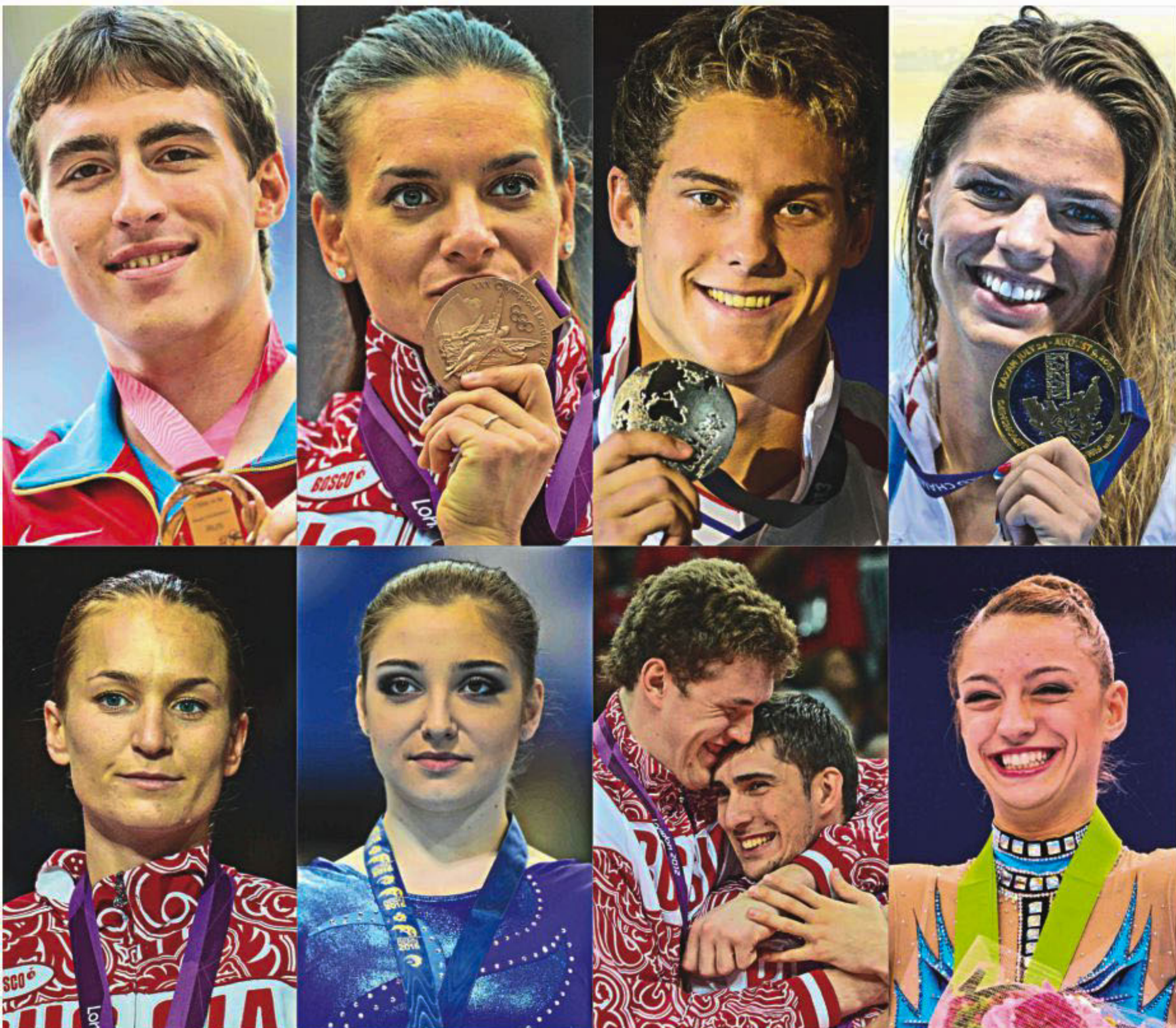
This combination of pictures shows some of the top Russian athletes that may miss the upcoming Rio Olympics as the International Olympic Committee said yesterday it will study legal options on banning all Russian athletes from the Rio Games. Top row, from L: Sergey Shubenkov (men's 110m hurdles), Yelena Isinbayeva (women's pole vault), Vladimir Morozov (men's 50m freestyle), and Yuliya Efimova (women's 100m breaststroke). Second row, from L: Sofya Velikaya (women's sabre), Aliya Mustafina (artistic gymnastics), Dmitriy Muserskiy (L) and Dmitriy Ilinykh (men's volleyball), and Evgenia Kanaeva (rhythmic gymnastics).