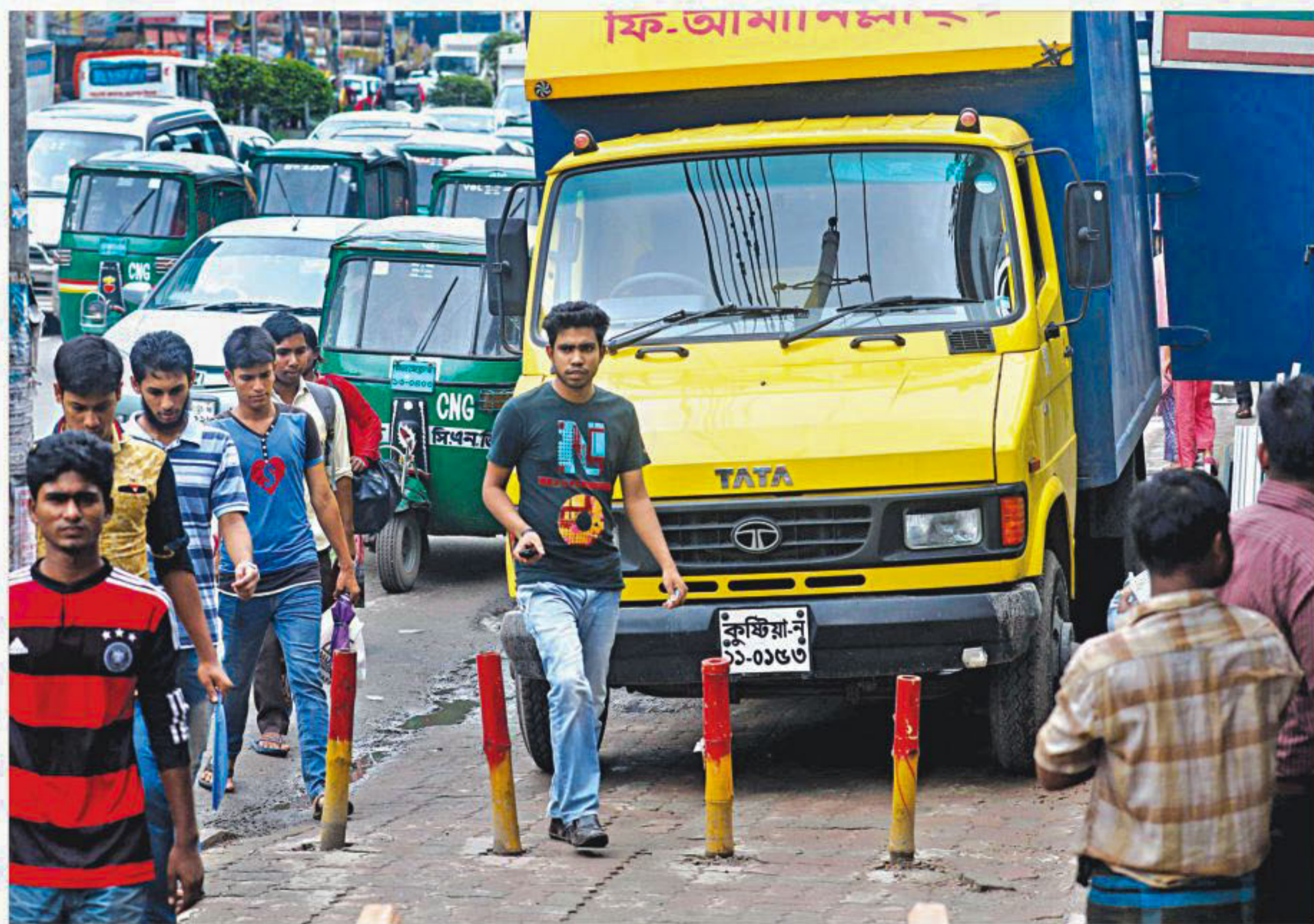
A covered van is parked on the footpath on Kazi Nazrul Islam Avenue in the city's Farmgate area yesterday, blocking the way for pedestrians. The vehicle would stay there for hours to unload goods at a shop, leaving pedestrians with no choice but to walk on the road and risk accidents. This is a common scene in the area.

Talking to The Daily Star SEE PAGE 2 COL 3