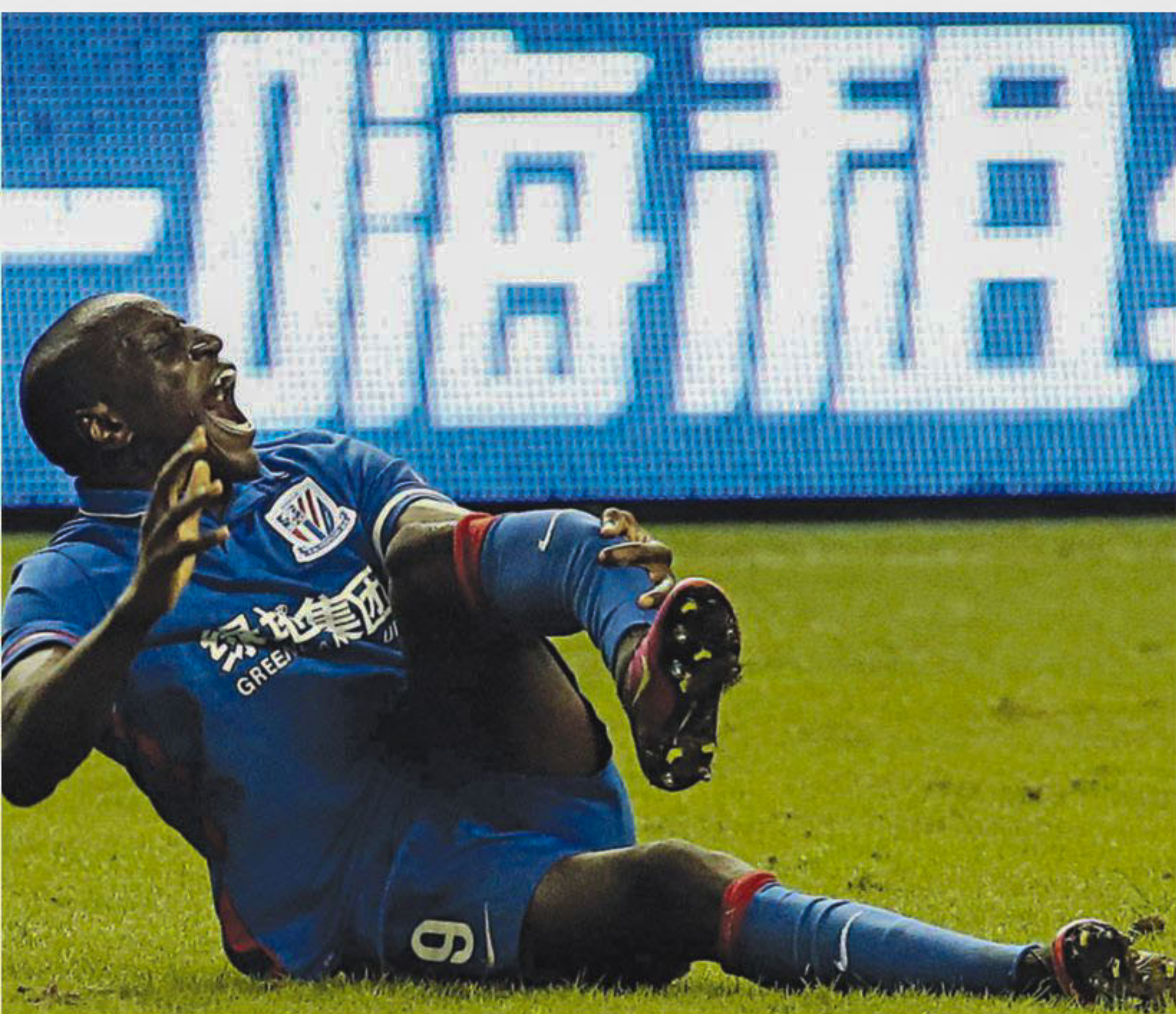
Shanghai Shenhua's Senegalese striker Demba Ba is in agony moments after breaking his leg during the Chinese Super League match against Shanghai SIPG in Shanghai on Sunday.