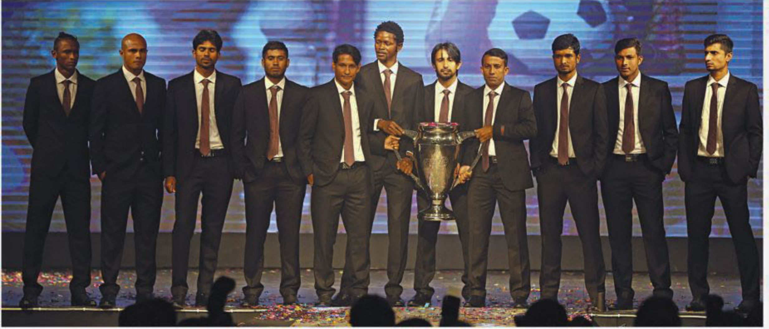
Captains of the 12 participating teams pose with the JB Bangladesh Premier League trophy during the league's logo and trophy unveiling ceremony at a hotel in the capital yesterday.