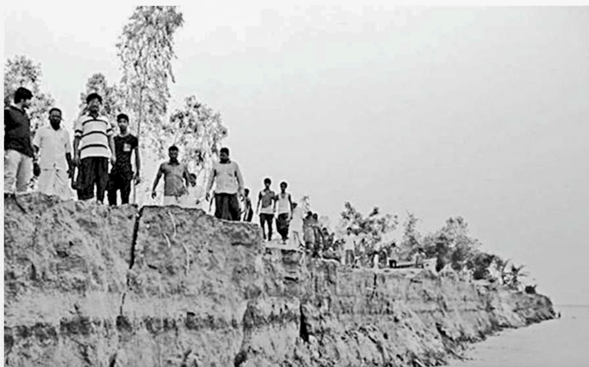
A scene of erosion at Jelepara in Bachamara union of Daulatpur upazila under Manikganj district.