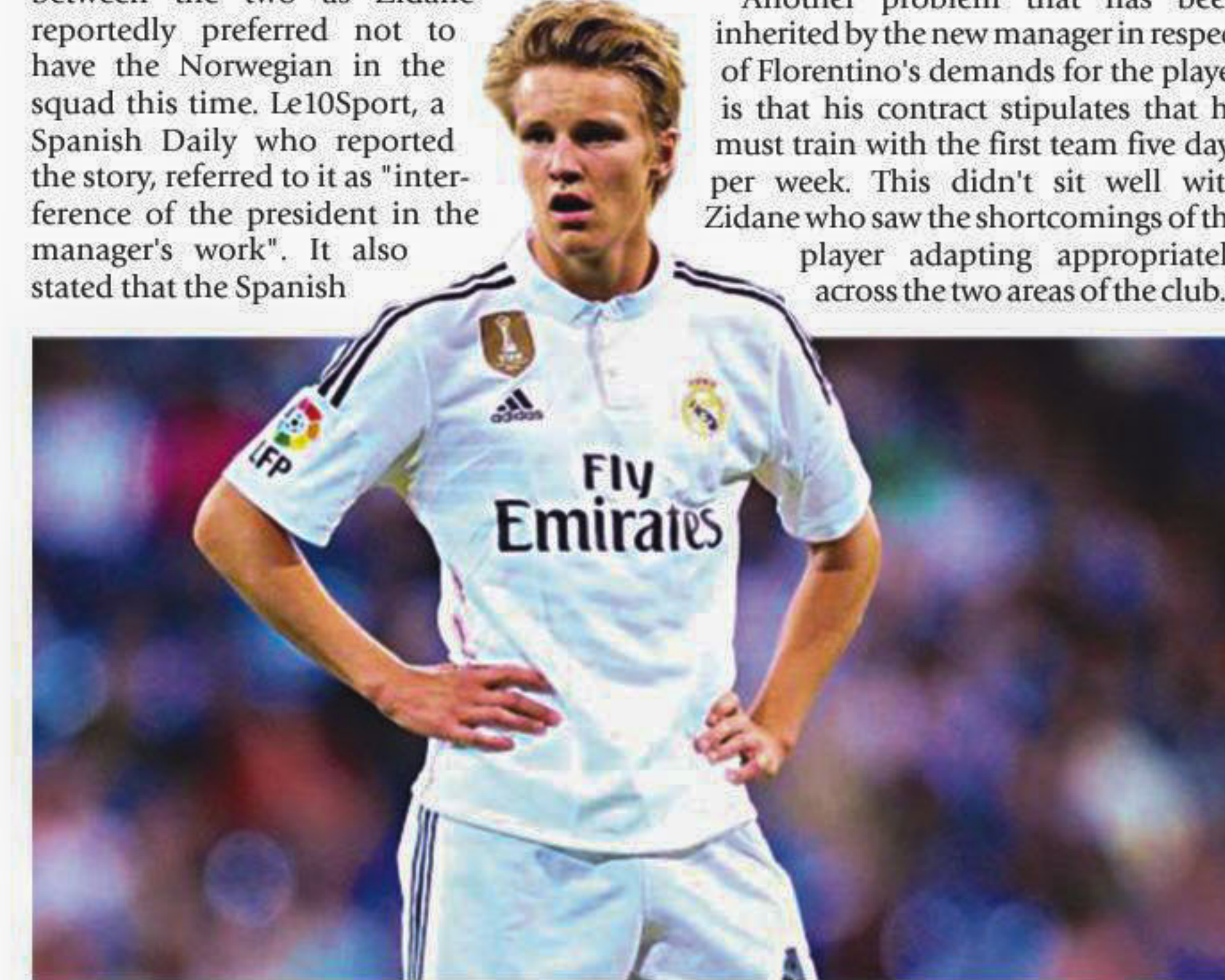
Martin Odegaard has failed to impress so far and now finds himself in a conflict between coach Zinedine Zidane and Real Madrid president Florentino Perez.

Another problem that has been inherited by the new manager in respect of Florentino's demands for the player is that his contract stipulates that he must train with the first team five days per week. This didn't sit well with Zidane who saw the shortcomings of the player adapting appropriately across the two areas of the club.