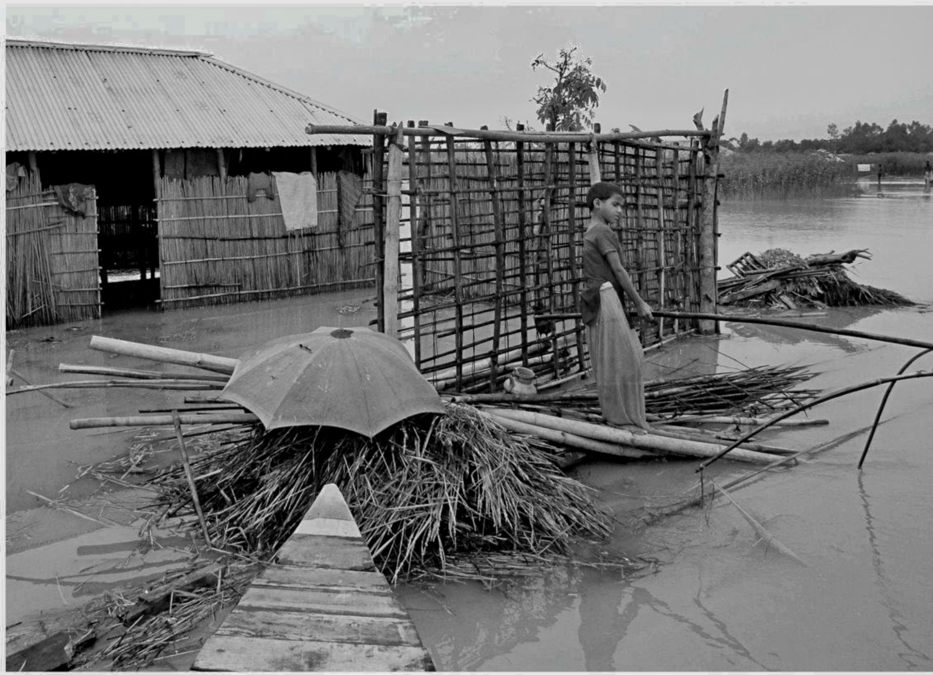
A child at a flooded house at Gobordhon village in Aditmari upazila under Lalmonirhat catches fish yesterday while other members of the family went to a safer place following sudden rise of water level in the Teesta River basin area.