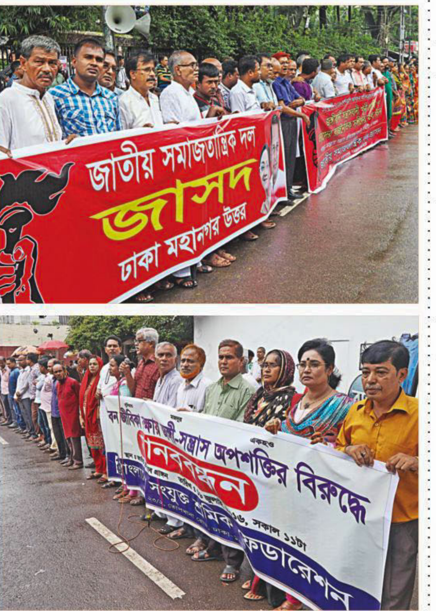
Calling for social awareness and tolerance, different socio-political and rights organisations hold anti-terrorism human chains at the capital's Shahbagh and Jatiya Press Club yesterday.