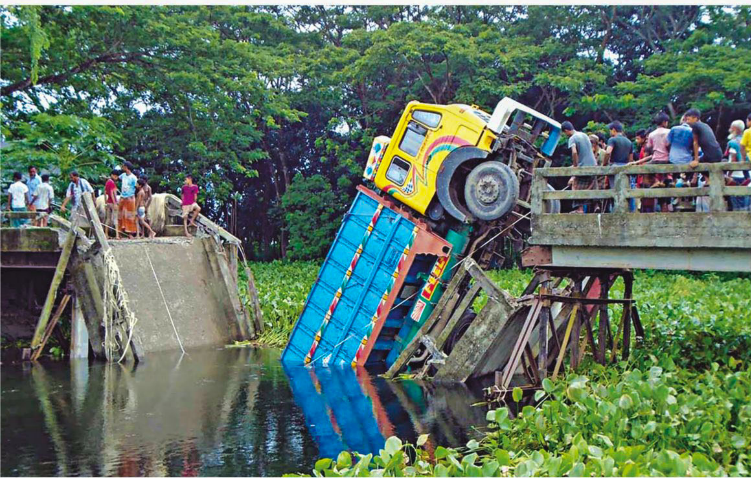
A sand-laden truck plunges into a canal as the bridge over the water body collapses in Basail area of Agailjhara upazila, Barisal, on Thursday, snapping road communications between Madaripur and Basail and four other villages of Agailjhara.